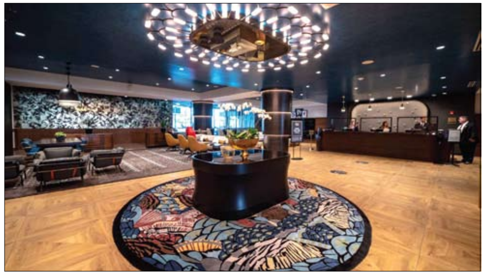
The Sable Hotel at Navy Pier, offering views of the city skyline and Lake Michigan.