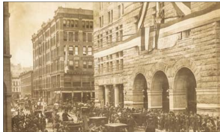
A rarely seen albumen print of Adler and Sullivan's partially completed Auditorium Building (theater entrance) taken during the 1888 National Republican Convention where Benjamin Harrison was nominated as presidential candidate.