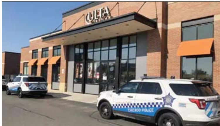
Chicago police units sit outside the Ulta Beauty, 2754 N. Clybourn, following a raid by shoplifters on Sept. 17.

Around 4 p.m. Sept. 20, an employee at Bottega Veneta admitted a man into the boutique