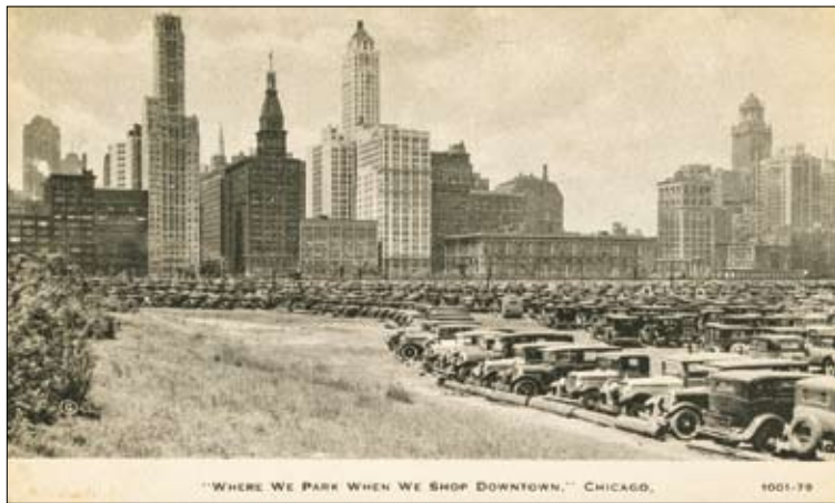
"Where we park when we shop Downtown Chicago." Photo of the Loop.

The show examines Louis H. Sullivan's innovative Garrick Theatre, once located at 64 W. Randolph St., which stood for only 69 years; and Frank Lloyd Wright's unprecedented Larkin Building, in Buffalo, NY, which stood for just 44. Two distinct presentations—Reconstructing the Garrick: Adler & Sullivan's Lost Masterpiece and Reimagining the Larkin: Frank Lloyd Wright's Modern Icon—feature 3D models and digital re-creations of the original edifices; salvaged architectural ornaments and artifacts; original furniture; historical documentation of the