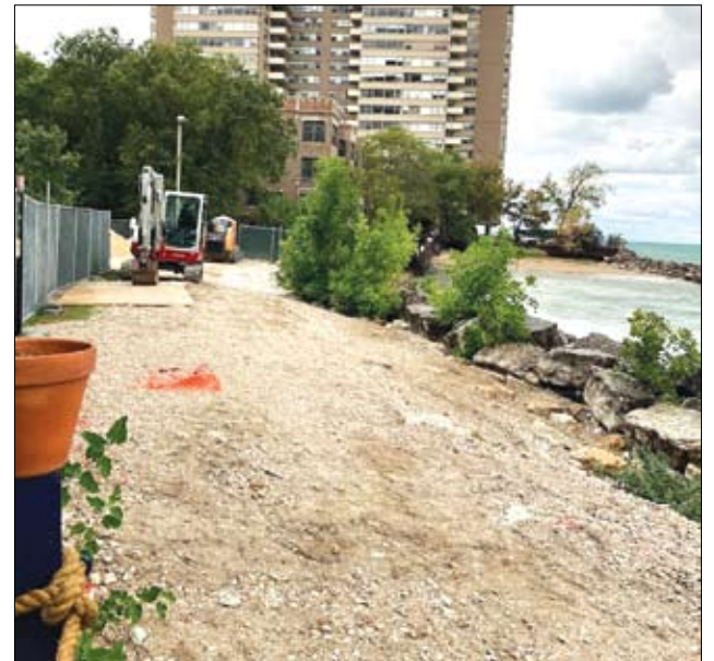
Berger Park, 6205 N. Sheridan Rd. is under construction.

The work consists of placement of armor stone along the Lake Michigan shoreline to arrest further erosion and damage caused by several storms from 2020, and reconstruction