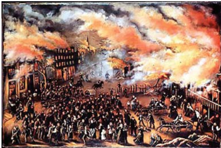
The Great Chicago Fire.

But as Chicago expanded and became the thundering commercial capitol of industry and finance, the swelling population could hardly restrict elected office to the commercial nobility.