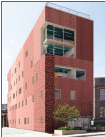
The new youth center at 1023 W. Irving Park Rd.

24, especially those who may be homeless. The nearly completed five-story, 20,000 square-foot structure at 1023 W. Irving Park Rd. is replacing the former location at 4009 N. Broadway, which was demolished in 2019.