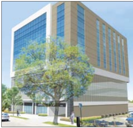
Artist rendering of a new out-patient facility on the Swedish Covenant campus, 2826 W. Foster Ave.

The new facility will be setback 10' from the curb and provide landscape improve-