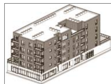
Artist rendering of the new proposed building at 7000 N. Glenwood Ave.