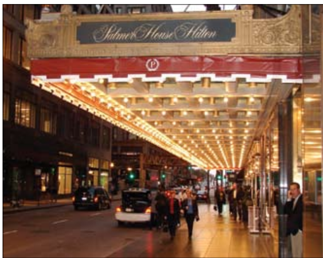
The Palmer House, 17 E. Monroe St., celebrates 150 years.