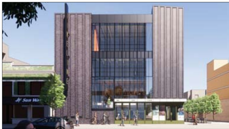
The new exterior for TimeLine Theater, 5033 N. Broadway.

Securing building permits, groundbreaking, and construction leaves the anticipated opening date for the building in early or mid 2024 for this $35 million project. In the meantime, TimeLine will continue to maintain operations in Lakeview East.