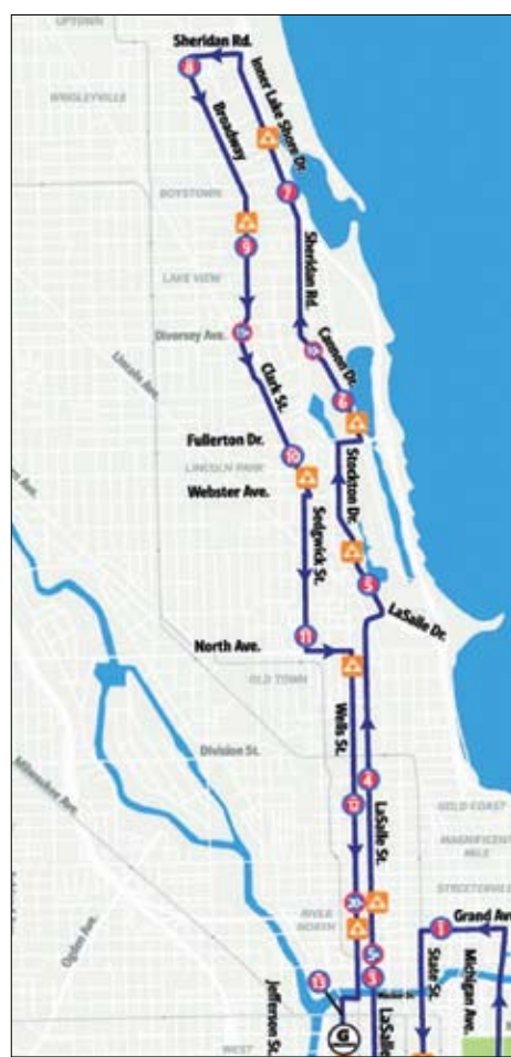
The North Side race route.

Event organizers are working closely with the City of Chicago, including the Dept. of Public Health, Streets and Sani-