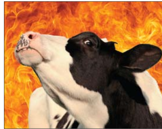
A city in ruins after the Great Chicago Fire and the Water Tower (center) that survived, and an artist's rendering of Mrs. O'Leary's slandered cow.

The conflagration at its height had the power to jump the expanse of the Chicago River, which offered meager resistance in holding back the forces of the urban inferno.