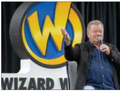
William Shatner will be at Wizard World one day only.