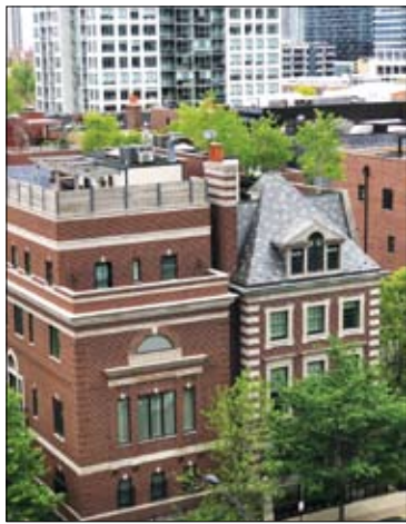
Sales in the Near North area was hot in August, with 43.1% more transactions than the same month in 2020.

"Many factors led to this increase, including the Federal Reserve communicating that it will taper its support of the capital markets, the broadening of inflation and emerging energy supply shortages which compound other labor and materials