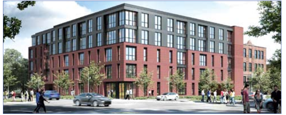
The Our Lady of Lourdes Church and grotto face an uncertain future after plans were announced to build a new high density building at 4641 N. Ashland Ave.