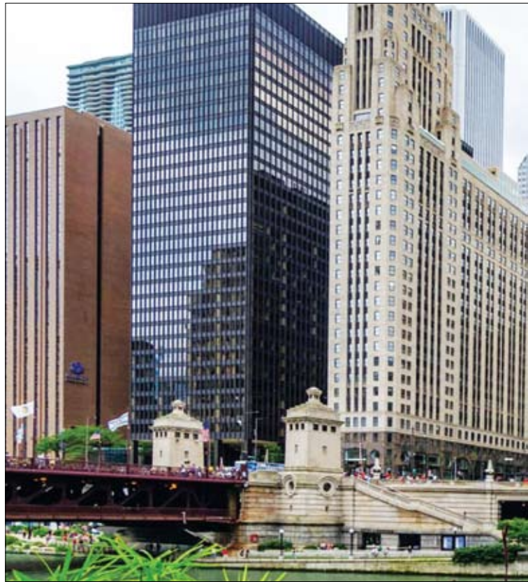
11 E. Wacker will be on the Open House Chicago tour.