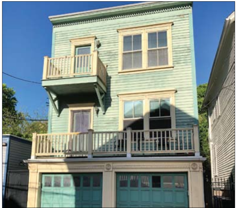
A Granny Flat is a small self-contained living space located on the same lot as a primary residence.