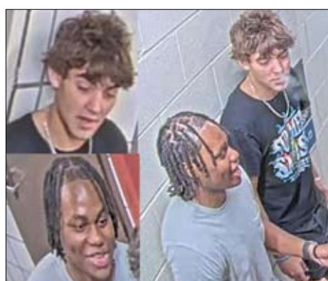
Surveillance images of suspects being sought in connection with a robbery aboard a CTA train in the Loop.

Police routinely issue community alerts af-