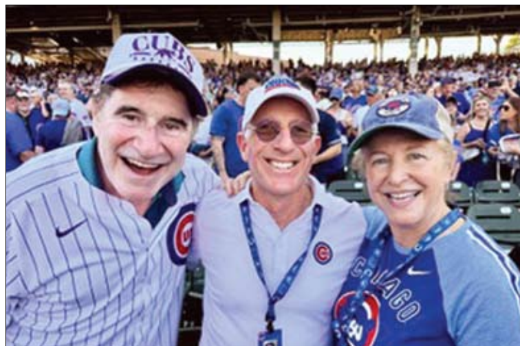
Actor Richard Kind (left) and friends.

Additional prohibited items on the course route include large bags (backpacks, suitcases and rolling bags), hard-sided coolers, costumes covering the full face, any non-forming bulky outfits extending beyond the perimeter of the body, props and non-running equipment, pets/animals (except for service animals that are trained to perform specific work