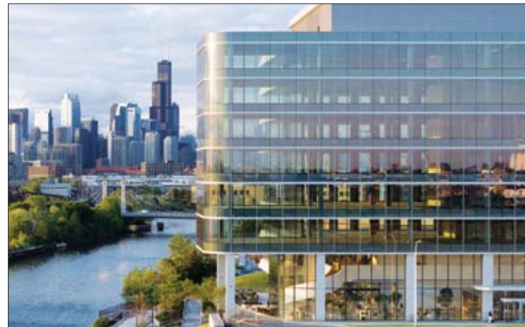
The vacant Life Science building at the former Lincoln Yards development, which is now called "Foundry Park."