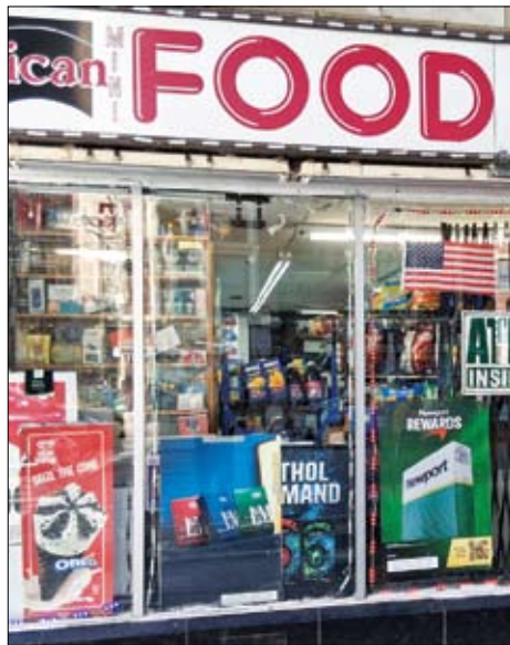
New American Mart window may violate a proposed ordinance.

The proposed legislation further requires “All public-facing windows must be clear and non-reflective such that they allow