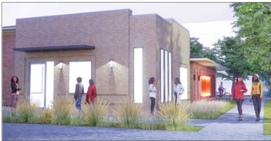
Steep Theater in Edgewater was just awarded another $880,000 in public funding for the construction of a new theater at 1044 W. Berwyn, bringing the total taxpayer-paid portion of the $6.3 million project to $3.87 million.