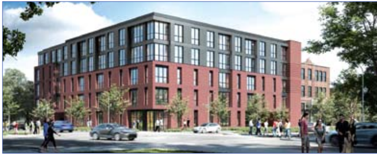
The Our Lady of Lourdes Church and grotto face an uncertain future after plans were announced to build a new high density building at 4641 N. Ashland Ave.