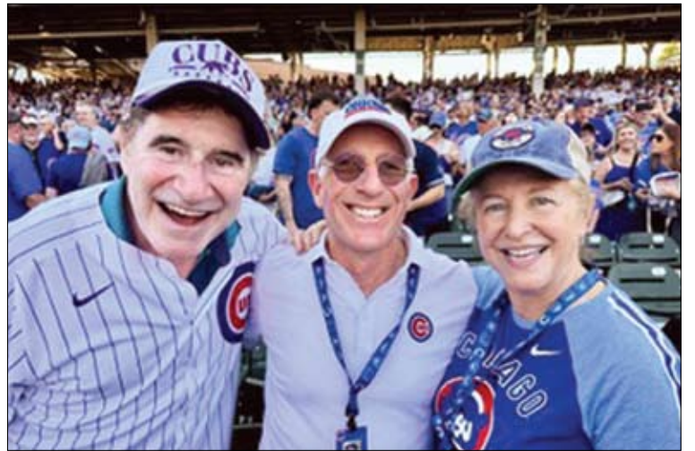
Actor Richard Kind (left) and friends.

Additional prohibited items on the course route include large bags (backpacks, suitcases and rolling bags), hard-sided coolers, costumes covering the full face, any non-forming bulky outfits extending beyond the perimeter of the body, props and non-running equipment, pets/animals (except for service animals that are trained to perform specific work