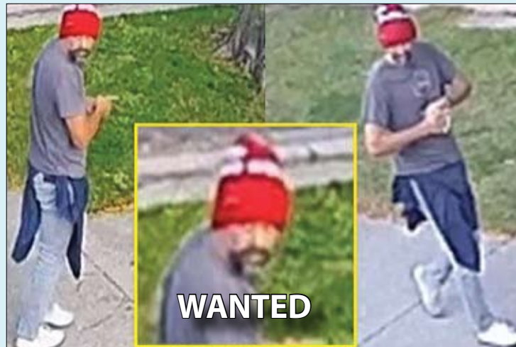
Police are trying to locate this man in connection with a sex crime involving children.

A shootout near the Howard CTA station on Sept. 30 left bullet holes in cars and shattered windows in business storefronts, but no injuries were reported. It happened at the same spot where a man was essentially executed in the middle of Howard St.