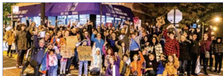
Supporters out front of The Women & Children First Bookstore in Andersonville.

Plans show a small patio with a few picnic tables, and a pocket park, which can serve as an area where Vienna could hold small events or concerts.