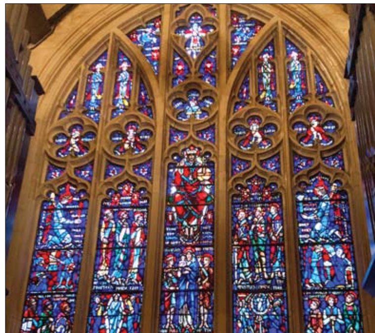
The stained glass window at Saint Chrysostom's Episcopal Church, 1424 N. Dearborn Pkwy.