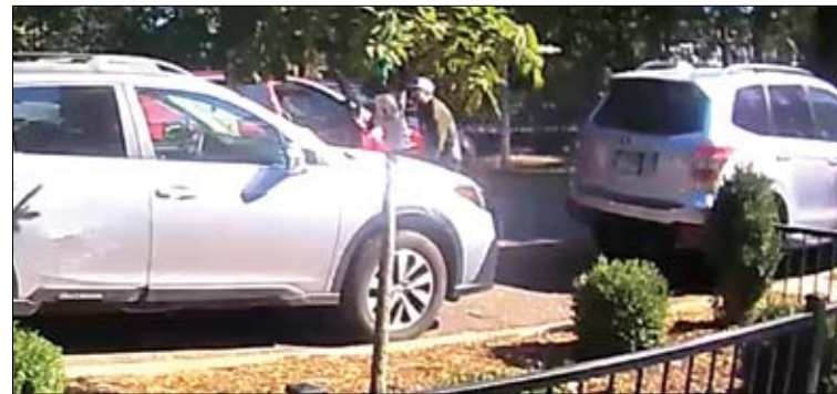
One of the gunmen involved in a shooting at Hamlin Park returns to his red SUV on October 4, 2024.