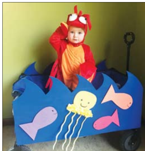
Henry the lobster rides the waves of his ocean-decorated wagon.

1. Using the box cutter, cut two pieces of the box to be the length of each side of the wagon. Cut the