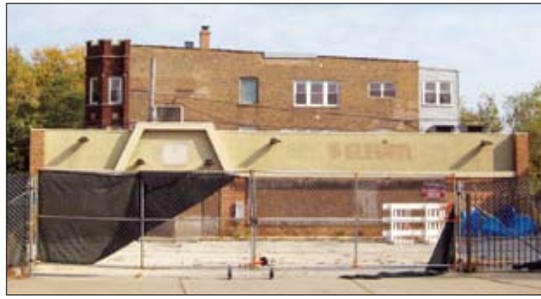
(L) An artist's rendering of the proposed four-story apartment complex at 5457 N. Clark St. Rental units were planned for the second through fourth floors and commercial space was earmarked for the first floor. (R) The southeast corner of Clark and Catalpa was the designated site for the development project.