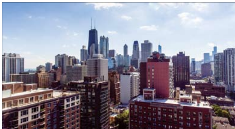
Mayor Lori Lightfoot's dark vision of the city's 2021 budget deficit skyrocketing to $1.2 billion is frightening to the average homeowner who will likely see their property taxes used to cover that deficit.

This bad news comes after homeowners scratched to pay the final installment of the largest