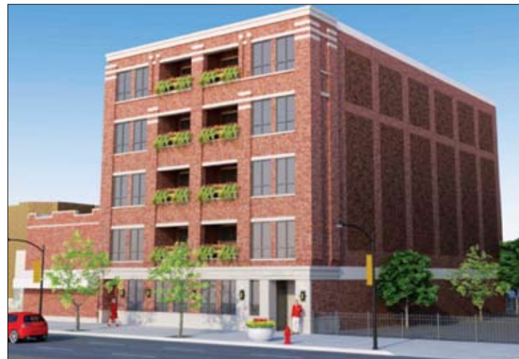
The proposed new development at 5828 N. Broadway.