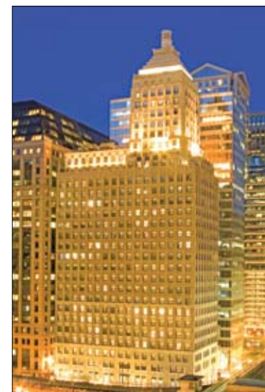
Century Tower, 182 W. Lake St., was converted from office space to luxury condominiums, and up to 75% of the original condo owners were investors.

country, placing Chicago among the top leaders in office redevelopment."