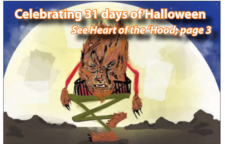
Rogers Park artist Nicolas Fonte's signature Water Tower Guy undergoes a different Halloween-themed movie character transformation each day during the 31 Days of Halloween.

Celebrating 31 days of Halloween See Heart of the Hood, page 3