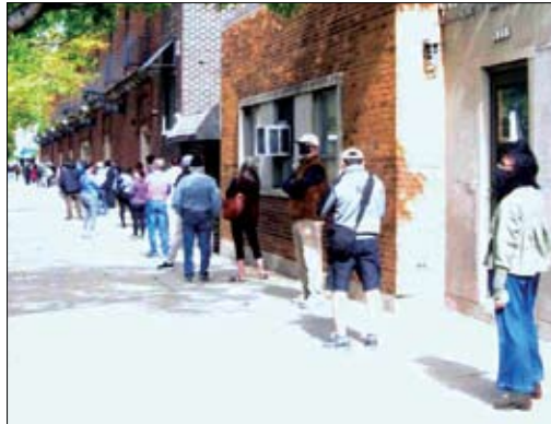
Long lines were seen throughout the North Side on the opening day of early voting. Waits of two to three hours to vote were reported at the armory, Warren Park in Rogers Park and Truman College in Uptown.