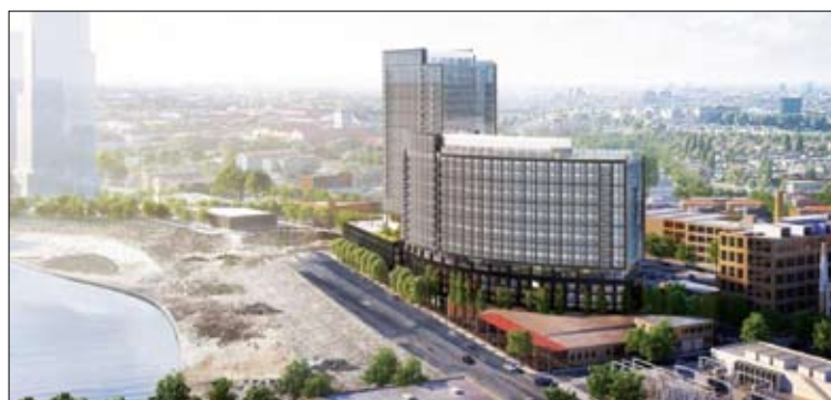
Lincoln Yards at 1840 N. Marcey. Image by Solomon Cordwell Buenz

Rising 215 feet, the southern building will be a 16-story tower with 308 residential units, but will