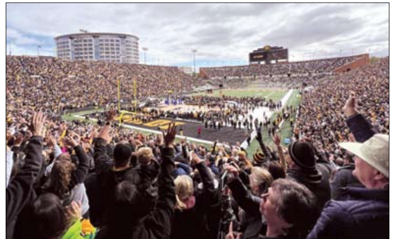
The "Crossover at Kinnick" exhibition game Oct. 15 broke the previous women's NCAA college basketball attendance record.

Concerns over data retention policies and data sharing also skirt the line over illegal search and seizure of a private citizens data.