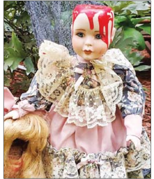
Dead on Damen is outside at Jordan Community Elementary School, 7414 N. Wolcott. Viewings are from 4:30 p.m. to 9 p.m. on most weekdays, and 4:30 p.m. to 10 p.m. on most weekend nights. A special Halloween night celebration will start at 6 p.m.