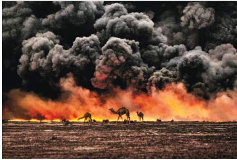
Famous American photographer Steve McCurry has a new show on display at Loyola's LUMA Museum. (Above) Afghan Girl and Ahmadi Oil Fields, Kuwait.

The showing also includes other very well-known pictures he captured throughout his 40 years of professional photography, including his most recent works.