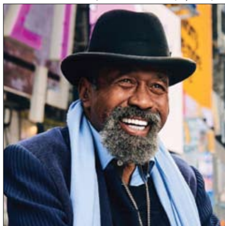
Ben Vereen