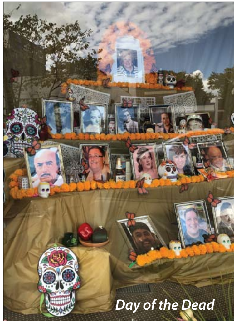
Day of the Dead

A pumpkin is considered giant if it weighs over 150 lbs. Giant pumpkins can grow over 2,000 lbs. Some giant pumpkins can grow up to 50 lbs per day if the conditions are favorable. Once these pumpkins are cut from their vines they can lose 6 to 8 lbs a day.