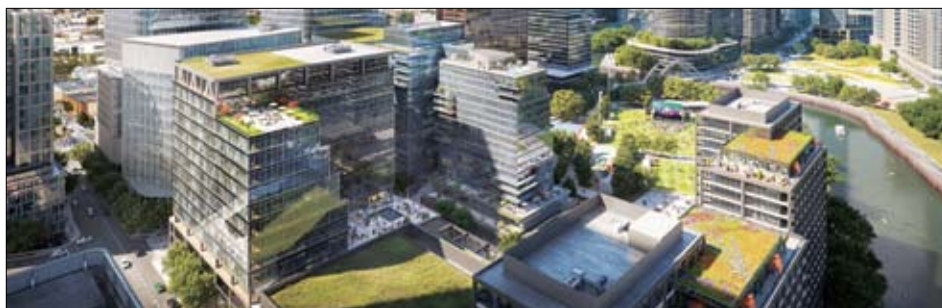
Sterling Bay's Lincoln Yards project seemed like a sure winner, with the large swath of riverfront property on the North Branch of the Chicago River and a sweet TIF deal that meant they kept all the property taxes. Then a commercial glut and high interest rates changed everything.

Sterling Bay and Harrison Street, who formed a joint venture for the project, invested over $19 million on renovations and tenant improvements, reports Terrell.