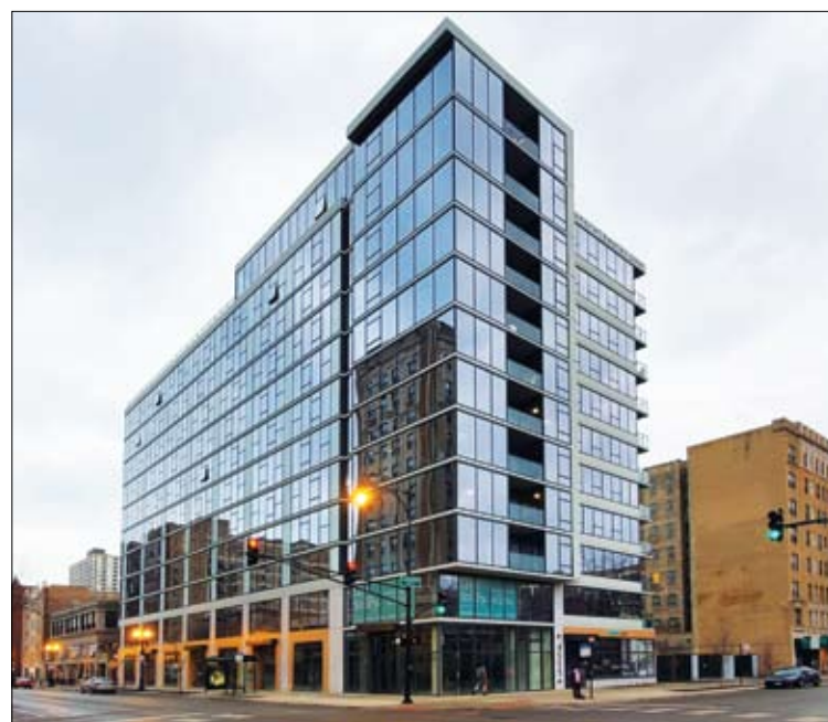
Upshore Chapter Apartments, 4555 N. Sheridan Rd.

The pilot program will conclude in June of 2025 when it is expected to become a permanent program of ticketing.