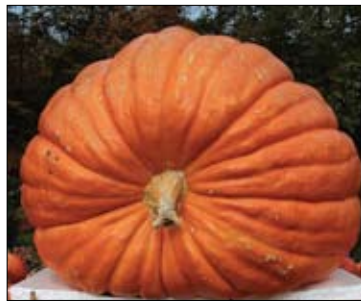
That's one giant genus Cucurbita [pumpkin].

Submitting a request within the 30-day grace period will not result in waiving of potential late fees and/or back charges.