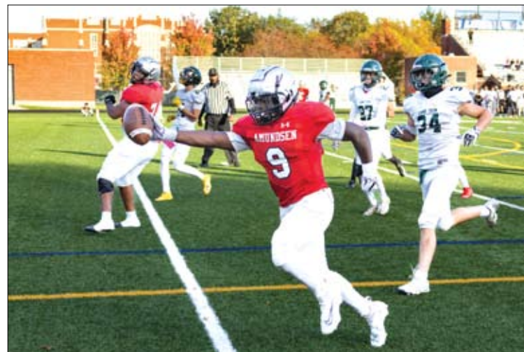
Amundsen running back scores a touchdown against Lane Tech.