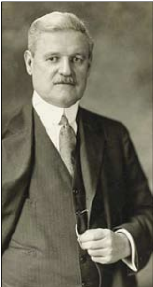
Chicago Mayor William Dever, 1923.