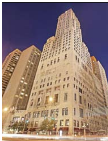
InterContinental Chicago hotel at 505 N. Michigan Ave.

Based on the recently released North Township property tax reassessments, the Mag Mile is doing just fine.