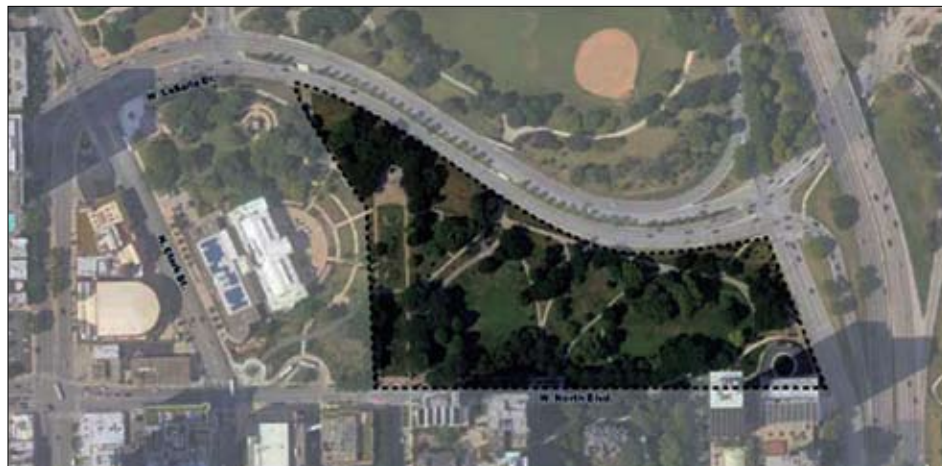
Planning is underway now to make changes to southern Lincoln Park, bounded by LaSalle St. to the north, Inner Lake Shore Dr. to the east, North Ave. to the south, and Clark St. to the west.

Phase one of the project will consist of path and other hardscape renovations funded by GCNA's state grant, with Phase two and additional phases to cover conservation of the Standing Lincoln statue and exedra, updated exhibit/interpretation for the monument, refreshing of the 8,200 s.f. garden, general landscaping improvements and infrastructure/lighting upgrades, and other features identified through the plan-