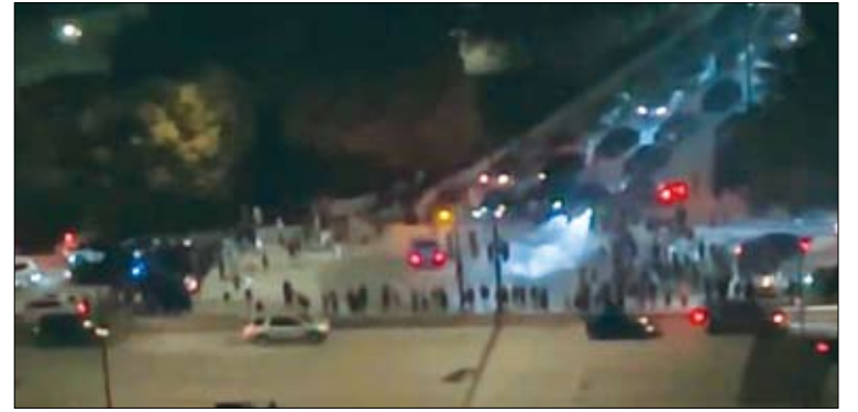
The northbound lanes of Lake Shore Drive at McFetridge Dr. were blocked and effectively shut down around 4 a.m. Sunday for a street takeover event.

The pilot program will conclude in June of 2025 when it is expected to become a permanent program of ticketing.