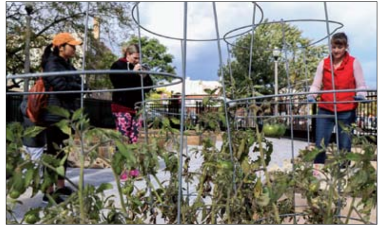
Growing season for tomatoes is almost complete, but winter weather brings a host of urban gardening possibilities.

By targeting the tax increase toward more expensive properties in high income neighborhoods, organizers are hoping to win the support of those living in low-income neighborhoods who think they would not be charged the additional amount... unless they happen to rent an apartment in a million dollar-plus building that changes hands.