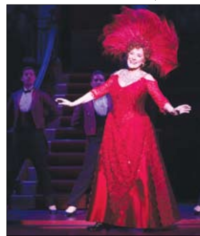
The incredible Betty Buckley as Dolly Levi in "Hello Dolly," at the Oriental Theatre.