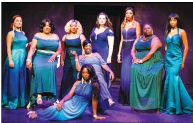
The cast of "Women of Soul," whose talent blew the doors off of the Black Ensemble Theater at Sunday's opening.