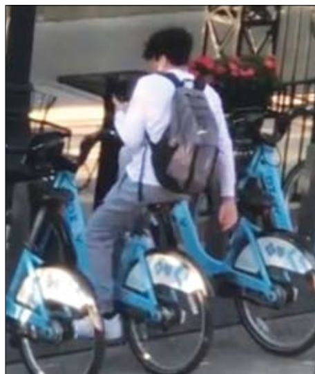
An Andersonville youngster pedals away on a docked and locked Divvy bike in early September. The Divvy remained secured in its station.

This newspaper first reported the Divvy theft problem in July. Thieves, we said, had