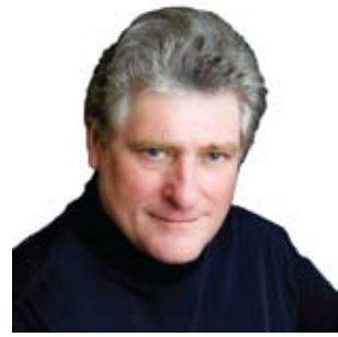
The Home Front By Don DeBat

Apartment rents are on the rise in Chicago and most other sections of the nation, but large and growing segment of renters continue to believe leasing a residence is a more affordable option than owning.