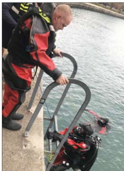
(L)CFD rescue diver emerges from Lake Michigan after a successful rescue dive training. (R) Divers enter the water for rescue training.

Chicago's busy lakefront offers the Air Sea Rescue Unit unique emergency challenges including, assistance to boats in distress, water rescues and air search missions. Divers assigned to the unit are trained under public safety rescue diver guidelines specific to Chicago's needs and particular environment. Air pilots are