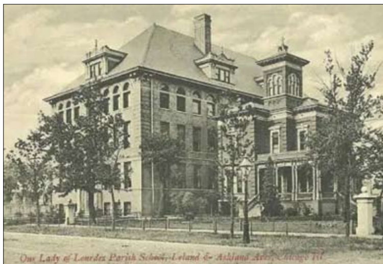
Our Lady of Lourdes Parish School, circa 1911.