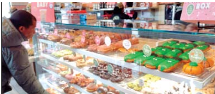
The new Stan's Donuts & Coffee, which held its grand opening on Oct. 28, is on the ground floor of a 200-unit apartment building at 4601 N. Broadway. A customer views the expansive variety of gourmet donuts and other tempting items at Saturday's grand opening.