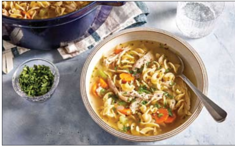
Soup made from leftovers provides small increments of warmth meant to keep one healthy and safe from foolish colds and the monster of pandemic during cold winter days and nights.

I found a wonderful old sketchbook of very fine, very large, thick handmade paper. When I layered on my paint in a rich, heavy impasto, I found the paper dried like fine