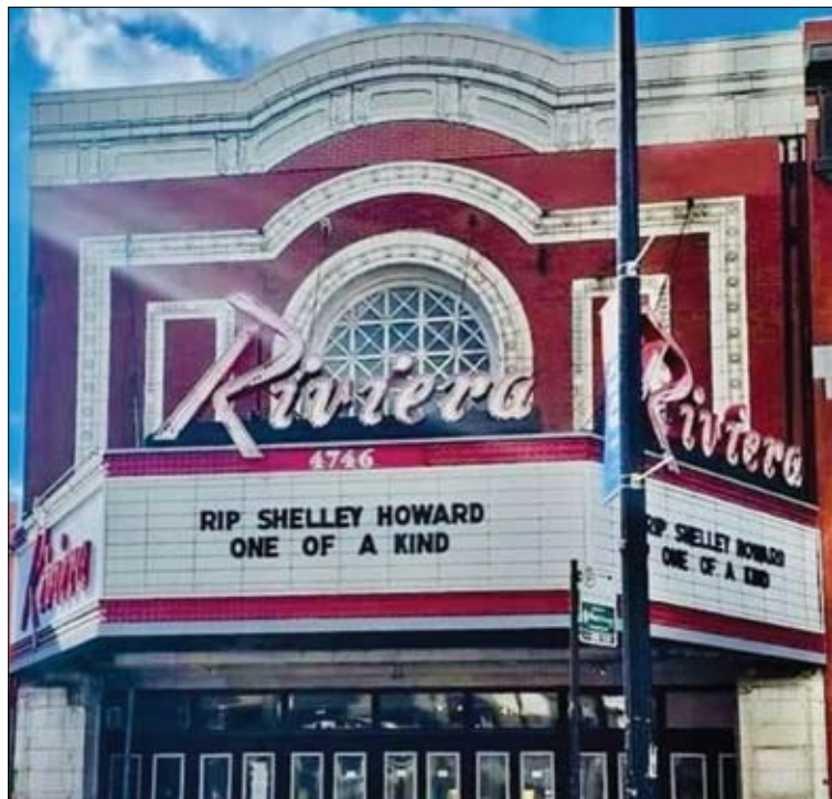
The Riviera Theater, 4746 N. Racine Ave.