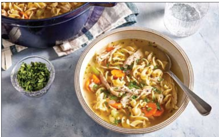
Soup made from leftovers provides small increments of warmth meant to keep one healthy and safe from foolish colds and the monster of pandemic during cold winter days and nights.

I found a wonderful old sketchbook of very fine, very large, thick handmade paper. When I layered on my paint in a rich, heavy impasto, I found the paper dried like fine