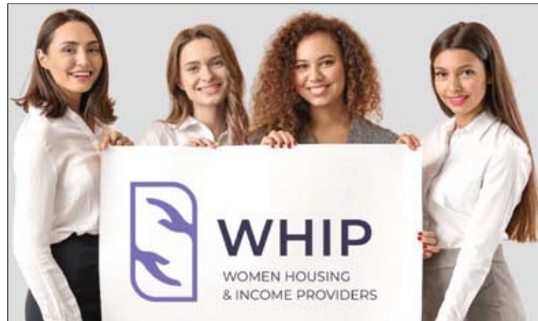
Women in the housing industry in Chicagoland are invited to WHIP's inaugural event, "Shift Your Perspective on Women-Owned Housing," on Nov. 14.

Women are visible only in certain areas of the property industry: 57% are real estate agents