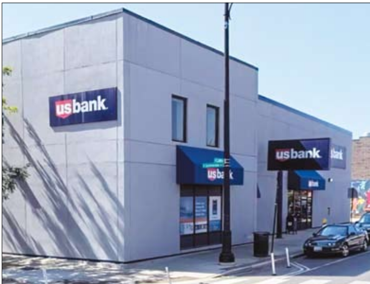
The potential site of Trader Joe's at 5340 N. Clark St.