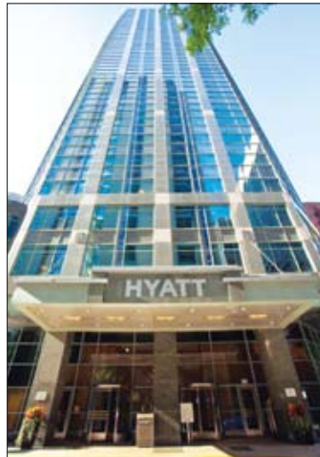
Hyatt Centric Chicago Mag Mile, 675 N. St. Clair St.