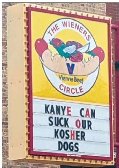
The Weiner's Circle in Lincoln Park made its feelings toward Kanye West's antisemitism very clear.

He said that in its Audit of Antisemitic Incidents for 2021, the Anti-Defamation League noted: "In 2021, ADL tabulated 2,717 antisemitic incidents across the U.S. This represents a 34% increase from the 2,026 incidents recorded in 2020 and is the highest number on record since ADL began tracking antisemitic incidents in 1979."