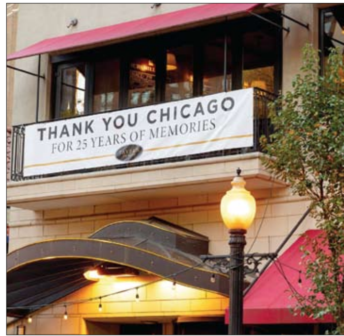
The Tavern on Rush has its well-earned reputation for judgment-free dining for clients of curious unpredictability.

BIG EASY: Thad Wong, Emily Sachs Wong and daughter, Hattie Wong, at Hansen's Sno-Bliz, in New Orleans, celebrating the parents of Tulane Univ., discovering a good Vietnamese restaurant, two good coffee shops, and another shop for snowcones... and bravo to Thad, named 2022 HousingWire Van-