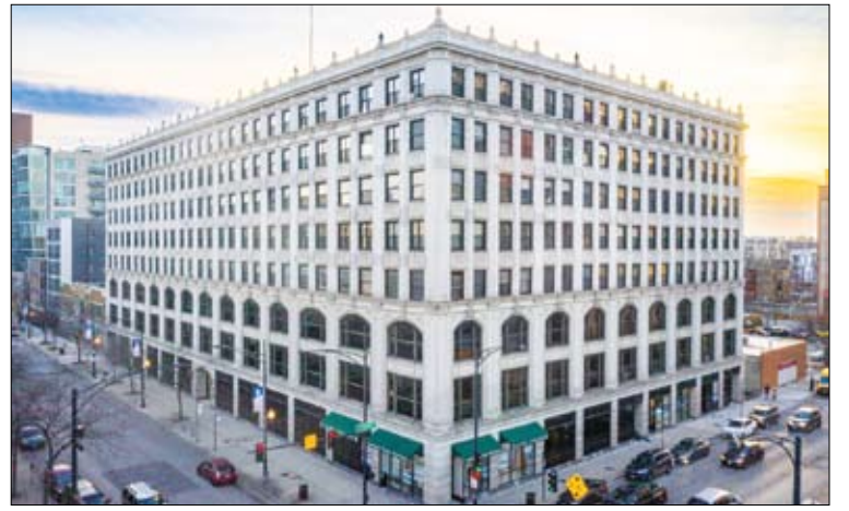
A century-old landmark building at 4750 N. Sheridan Rd. in Uptown is getting its own Tax Increment Financing District to help pay for its rehab.

"Also of great interest is the reuse of the historic building over time, from insurance offices in its earliest years, to a multitude