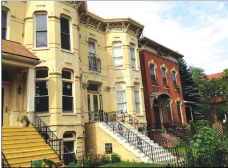
Chicago-area borrowers who move quickly still have a chance to lock in bargain mortgage rates, reports Rate-Seeker.com.

Meanwhile, the rate on 15-year fixed mortgages rose to an average of 2.37% from 2.33% a week earlier. A year ago, lenders were quoting a rate of 2.32% on 15-year fixed loans.