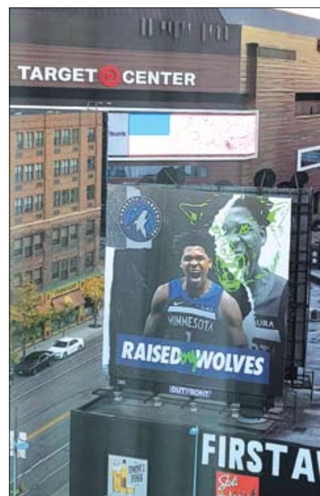
"City view," from our hotel room.

The best part about our trip to Minneapolis was, of course, the concert. The Rolling Stones are still filled with an incredible vitality, although Charlie Watts was definitely missed. I'm sad to know that this