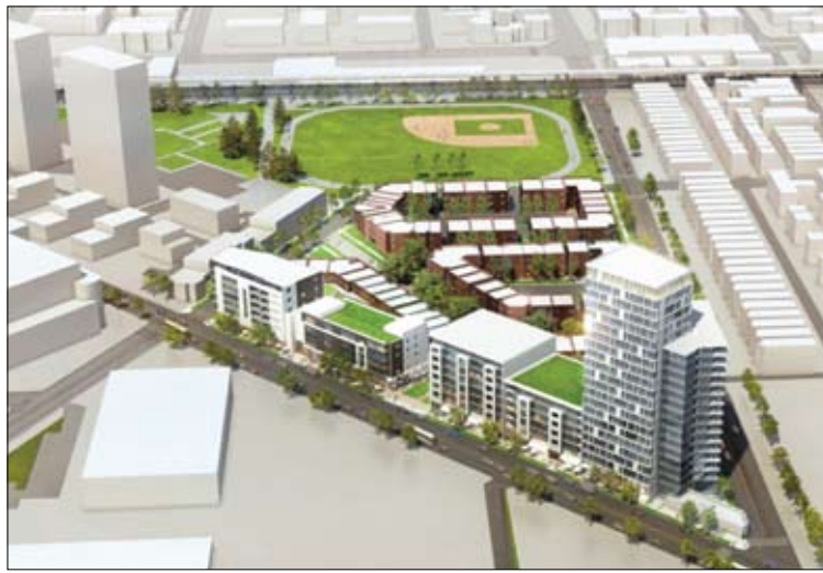
(L) Rendering of phase one tower of Cabrini Green redevelopment by Gensler. (R) Phase one site view of Cabrini Green redevelopment by Gensler.