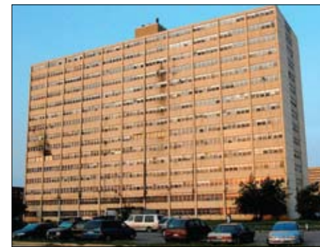
One of the original Cabrini-Green buildings.

Including the second phase of the project which would be laid out similarly with an anchoring tower on the site bound by W. Division St., the project would bring 1,058 mixed-income units with 265 of those set aside for former Cabrini-Green residents. The complex would also boast over 100,000 square feet of commercial space and nine acres of open space, however a developer for the second phase has