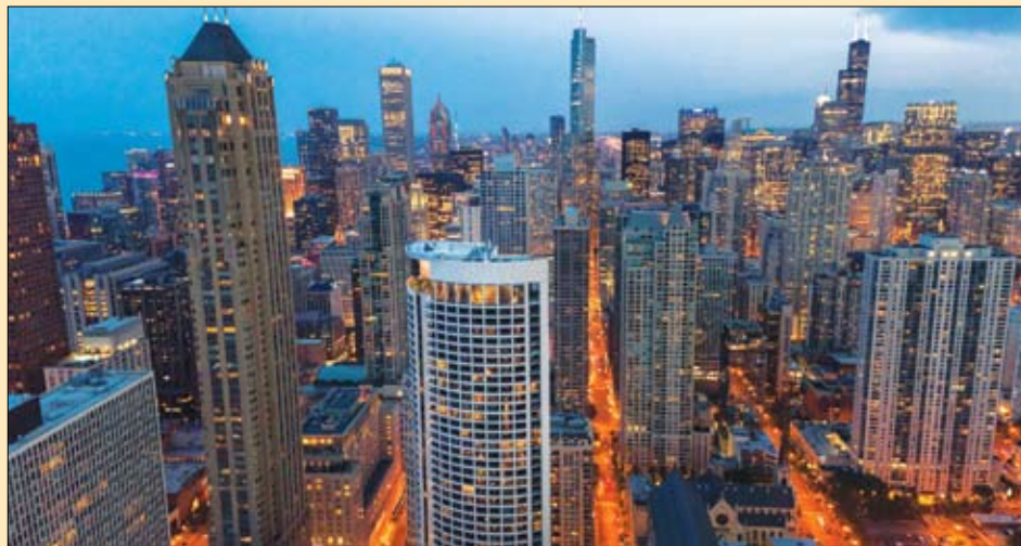
The Clare at 55 E. Pearson St. offers enriching activities in the heart of the Gold Coast.

For instance, The Clare has four distinct dining venues with gourmet offerings developed by renowned Chef