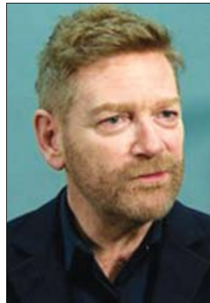
Sir Kenneth Branagh