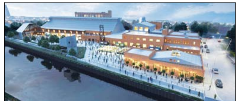
The Morton Salt building is one of the most recognizable buildings in the North Branch Corridor, due to its dramatic 50 foot ceiling heights, column free space and over 500 linear feet of Chicago River frontage.