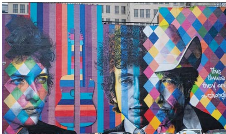
The Bob Dylan mural was definitely a highlight.

little further down the hall, I could have seen more lit-up jumbotrons and a slice of Target Field, which is where the Minnesota Twins play.