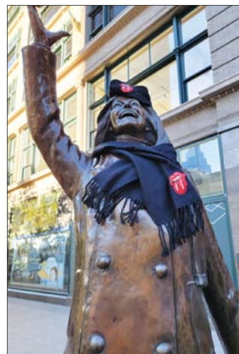
We gussied up the Mary Tyler Moore statue.

could -- and more than likely will -- really be the last time.