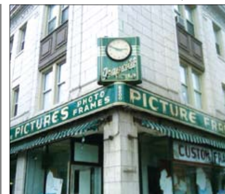
6200 N. Broadway will get new life soon.

The holder of the casino license has the opportunity to operate a temporary casino for up to 24 months (subject to a 12-month extension) and, thereafter, a permanent casino located in the City. The winning ap-