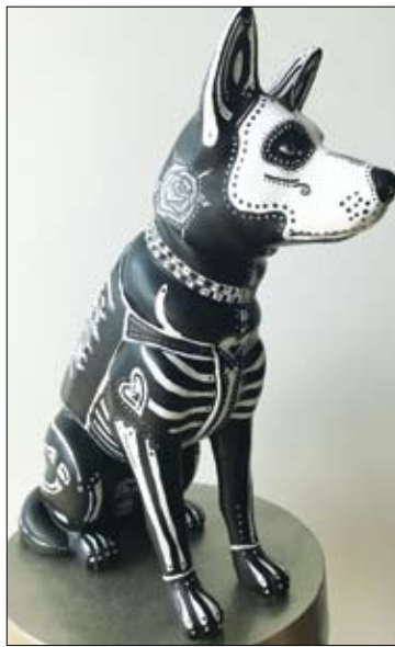
K9 mini up for auction.

“The future is uncertain, for we do not know if, how, or when Our Lady of Lourdes will combine with other parishes. It is important to remember why we are in this position in the first place. We are creating a path forward,”