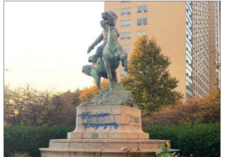
Some of the graffiti that was scrawled on the statue of Gen. Philip Sheridan.