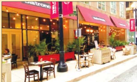
Providing local restaurants with business is as important for The Clare as it is for the restaurants themselves.

Betsy's go-to restaurants in the neighborhood are Bistronomic, a contemporary French Bistro; and Mozzarella Store, a Neapolitan pizzeria and café. When the weather allows, she eats out about once a week, made possible by outdoor patio seating and proper precautions at both locations.