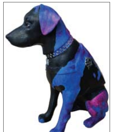
K9 mini up for auction.

Proceeds raised from the auction will fund the new K9 & Equine Plaza, which will be located just north of the water wall at the Gold Star Families Memorial and Park just east of Soldier Field. The horses and K9s are considered police officers too, and Foundation officials aim to