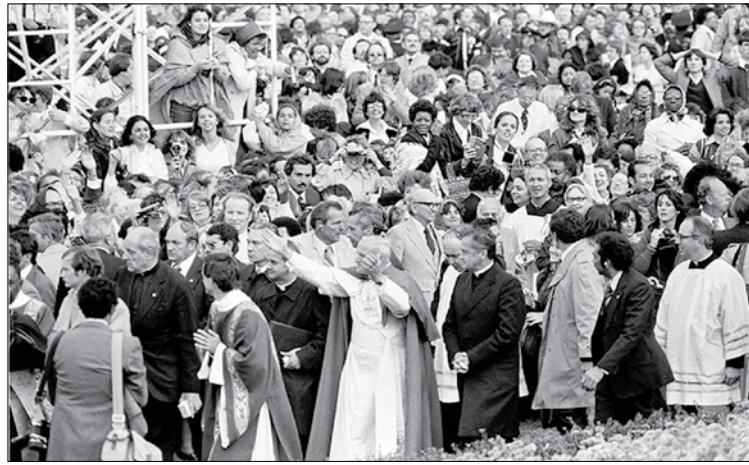
John Paul II arrives at Grant Park, October 1979.