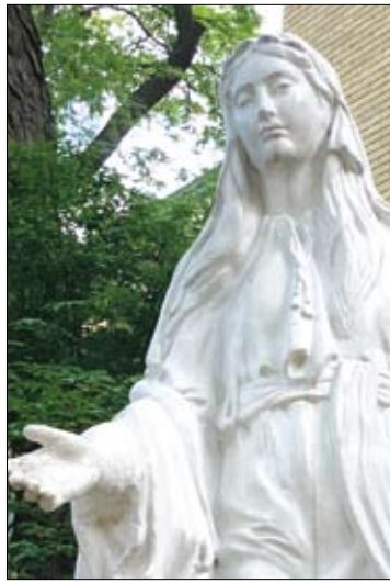
As part of the Chicago Archdiocese's Renew My Church campaign, the Our Lady of Lourdes Church in Ravenswood is at risk of being shut down.