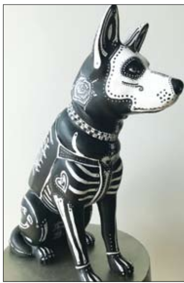
K9 mini #31 up for auction.

on the Friends of the Edgewater Library website, foelchicago.org.