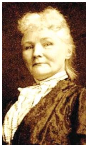
Mary Harris "Mother" Jones

Mother Jones lost her husband and their four children, (all under the age of five), in 1867, during a Yellow Fever epidemic in Memphis, TN. It marked a turning point in her life.