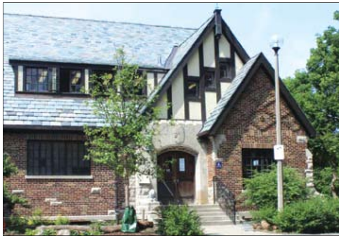
(L) Indian Boundary Park Field House at 2500 W. Lunt Ave. Courtesy Eifler & Associates (R) Indian Boundary Village plaque.

For more information, and to request dance apparel, contact Synapse Arts at info@synapsearts.com .