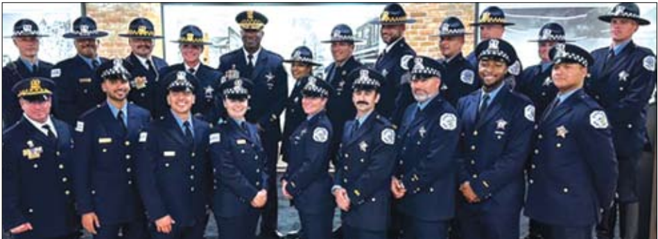
Inaugural "Back the Blue Italian Style" at the Morgan Arts Complex.