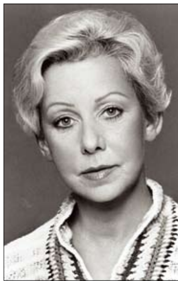
Mayor Jane Byrne

They often vied for the same political office. Byrne often appearing as a "confounding critique" of Daley's, causing mayhem and political recalibration.