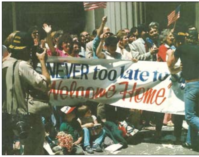
It's been 37 years since supporters organized a Veteran's parade and some of the scars from the Vietnam War started to heal. The Chicago Vietnam Veterans Welcome Home Parade was held on June 13, 1986. The parade eventually swelled to well over 200,000 vets. Some estimated the crowd at 300,000 to 500,000.