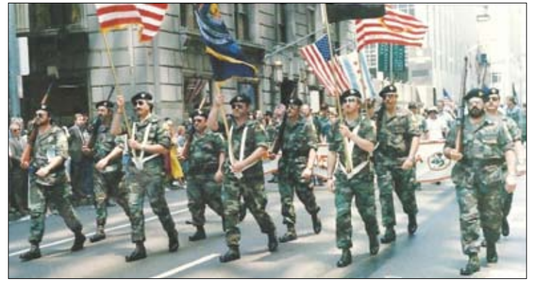
On this Veterans Day, we say "thank you" for the service, and remember the massive Chicago welcome home parade of 1986.

On the local CPD radio frequency, a police sergeant said he saw the hijacked Mercedes speeding away and running lights as it left the area. He decided against pursuing the car in the interest of public safety.