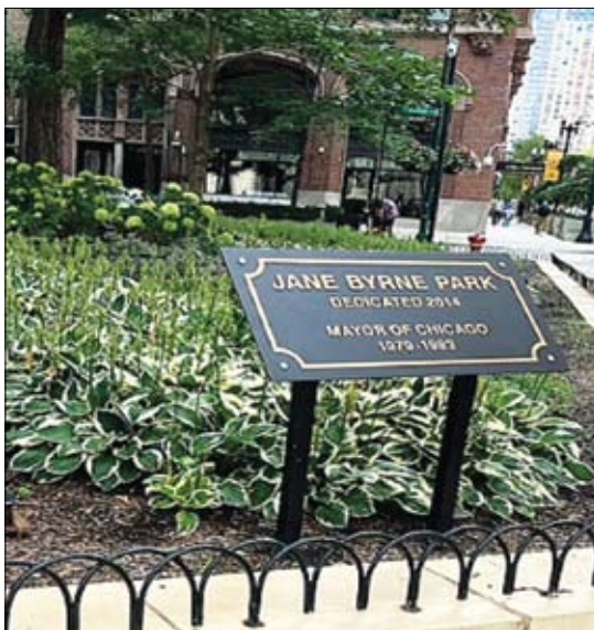
Jane Byrne Park, 108 E. Pearson St., adjacent to the Chicago Water Tower along Michigan Ave. was dedicated in 2014 to the former mayor.

But no citizen has ever been memorialized on their own from the Great Fire. Doing so now, demonstrates a failure to understand both the Great Fire and the Recovery.