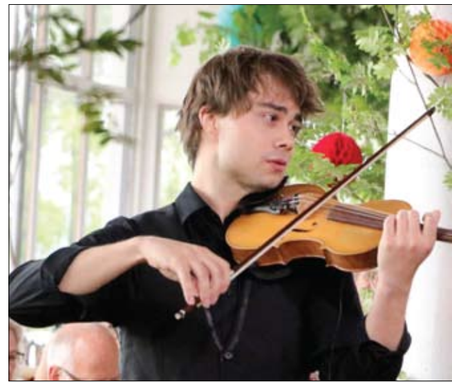
Alexander Rybak.