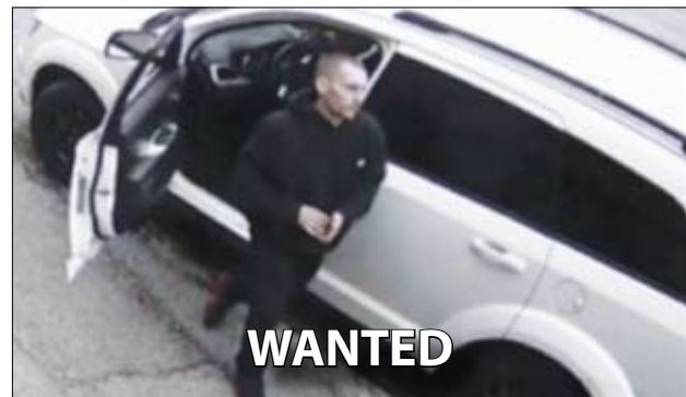
Chicago police are looking for this man in connection with burglary and theft cases on the North Side.

CPD's Town Hall 19th District released this image of the suspect, who drives a white Dodge Journey. According to the tweet and police data, the man is suspected of breaking into a garage in the 1900 block of W. Barry 4:54 p.m. Oct. 24. Additionally, he is wanted for the theft of more than $500 from a residential parking garage in the 3600 block of N. Lake Shore Dr.