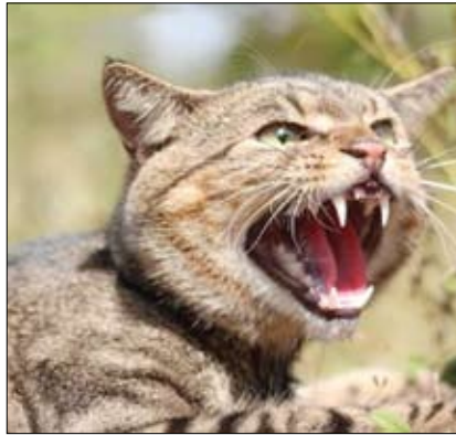
(L-R) Feral cat. Chicago's present is far deadlier and more torturous to our urban landscape than Prohibition ever was.

For all of Chicago's reputation as being the hoodlum capitol of America in the 1920s, there's not much left to look at today. Capone's headquarters at the Metropole Hotel, 2300 S. Michigan Ave., and later the Lexington Hotel at 2135 S. Michigan Ave., have long been demolished. (Though not before ABC reporter Gerald Rivera ransacked the Metropole's empty vaults in 1986 without discovering any Capone treasure.)