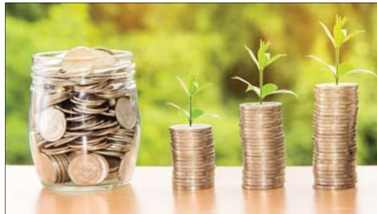
While CD interest rates of 4% sound like a great deal today, it is likely they will move higher in the coming months as the Federal Reserve Board continues to raise the short-term funds rate to put a damper on inflation.

As with all investments, there are benefits and risks associated