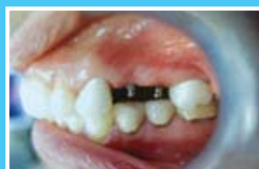
2. Implant Placed