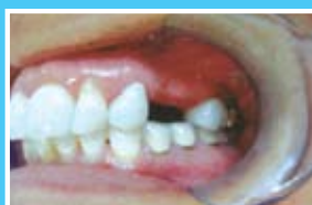
1. Consultation and Pre-Op

Single tooth crowns and/or denture stabilizations