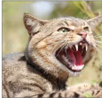
(L-R) Feral cat. Chicago's present is far deadlier and more torturous to our urban landscape than Prohibition ever was.

For all of Chicago's reputation as being the hoodlum capitol of America in the 1920s, there's not much left to look at today. Capone's headquarters at the Metropole Hotel, 2300 S. Michigan Ave., and later the Lexington Hotel at 2135 S. Michigan Ave., have long been demolished. (Though not before ABC reporter Gerald Rivera ransacked the Metropole's empty vaults in 1986 without discovering any Capone treasure.)