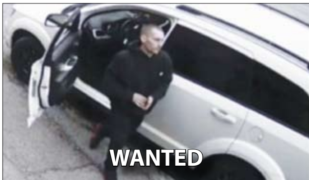
Chicago police are looking for this man in connection with burglary and theft cases on the North Side.

CPD's Town Hall 19th District released this image of the suspect, who drives a white Dodge Journey. According to the tweet and police data, the man is suspected of breaking into a garage in the 1900 block of W. Barry 4:54 p.m. Oct. 24. Additionally, he is wanted for the theft of more than $500 from a residential parking garage in the 3600 block of N. Lake Shore Dr.