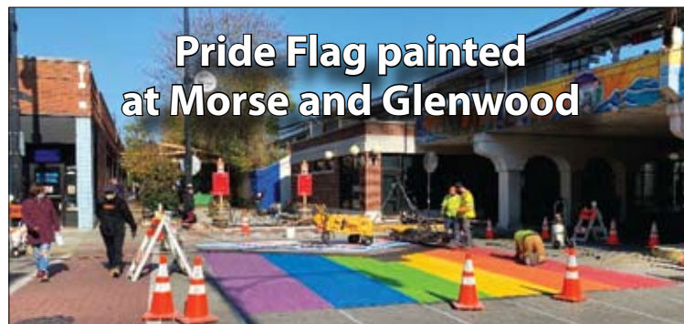
Pride Flag painted at Morse and Glenwood