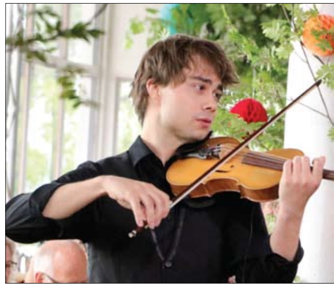
Alexander Rybak.