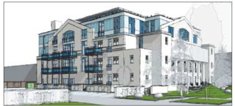
The orange-rated Philadelphia Romanian Church of God, 1713 W. Sunnyside, is seeking a zoning change in order to rehab the church into a 70-unit rental apartment building.