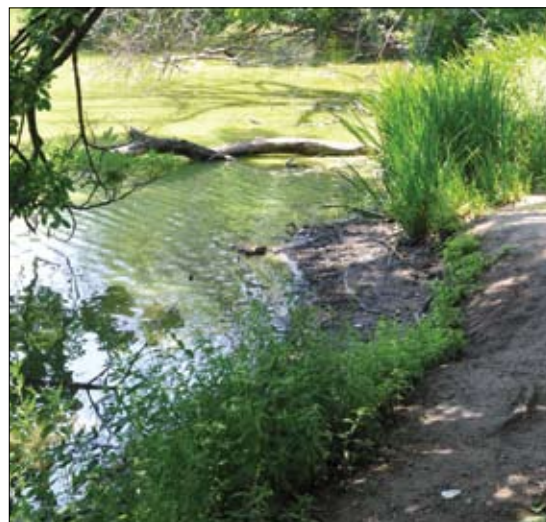
Three community virtual meetings will be held over the fate of North Pond in Lincoln Park, 5:30-7:30 p.m. today, Saturday, Nov. 14, 9:30-11:30 a.m., and Tuesday, Nov. 17, 1-3 p.m.