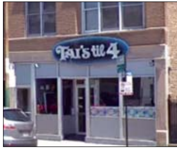
Tai's Til 4 at 3611 N. Ashland.