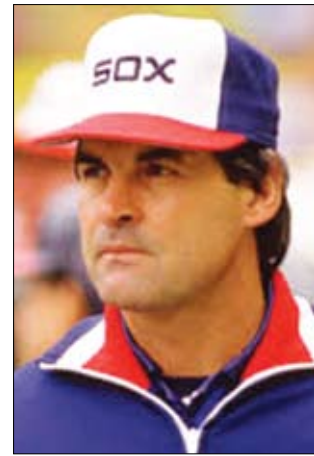
Tony La Russa