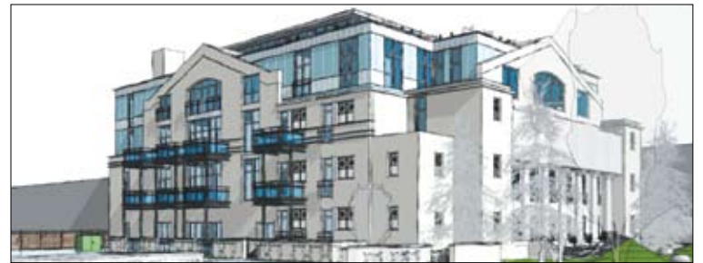
The orange-rated Philadelphia Romanian Church of God, 1713 W. Sunnyside, is seeking a zoning change in order to rehab the church into a 70-unit rental apartment building.