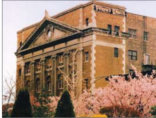
The John Buck Co. and Free Market Ventures is moving forward on a nine-story project at 4601 N. Broadway [left], while Peoples Church of Chicago, 941 W. Lawrence Ave., [right] has retained MB Real Estate to sell their historic building.

A busy corner of Uptown will see more construction as a new project grows on the northeast corner of Broadway and Wilson.