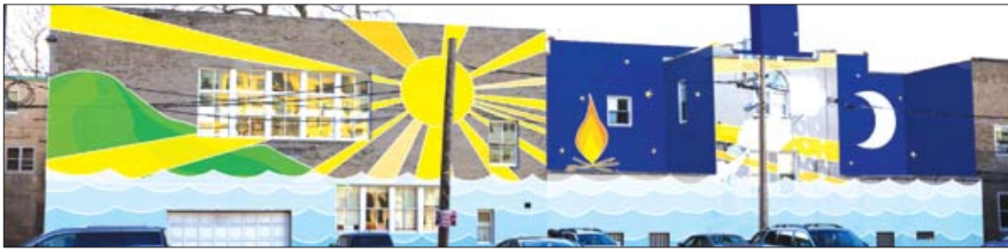
Known for his protection of animals and a life of true poverty, St. Francis wrote the Canticle of the Sun in late 1224 while recovering from an illness.

The two-story building adjacent to the parking lot next to St. Ita's Church — which makes up the back half of two buildings belonging to St. Thomas of Canterbury School, 5525 N. Magnolia Ave., — will soon be the canvas for a large new mural in Edgewater, titled Canticle of the Sun.