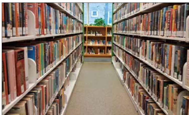
Under the current budget proposal, the Chicago Public Library's Collection (books) Budget will be cut in half, from $10 million to $5 million.

Ald. Samantha Nugent, [39th], writes in the Chicago Tribune that, "The goals we set cannot only be considered individually because they all rely on a fundamental foundation – access to knowledge. Public libraries are our most critical doors to that access, but the proposed 2026 City of Chicago budget is threatening