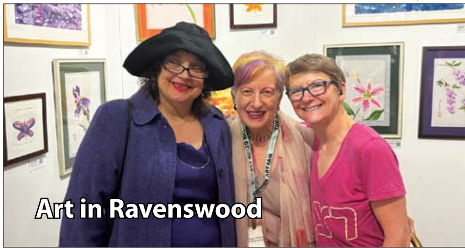
Art in Ravenswood