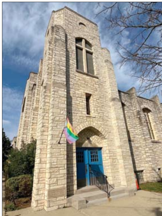
CHURCH see p. 12

"The impending demolition of Ravenswood Presbyterian Church is yet another loss to the Ravenswood community. This indicates we need protections in place to protect these resources looking to the future, but at the same time, consider a Chi-