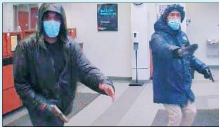
Two gunmen rob the Byline Bank, 7050 N. Western Ave., on Dec. 23, 2023.

CPD said the victim was taken to Northwestern Memorial Hospital,