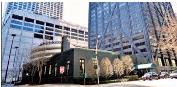
Then and now: The Casino Club.

late pal, the Hon. Desmond Guinness. Countless buildings of 18th Century refinement have been saved from destruction by loyal members. Rosie was a gallant supporter of the mission to rescue these flawless structures of unmatched design. The IGS was honoring Rosie's generous memory with a scholarship in her name to support the work of young architectural scholars.