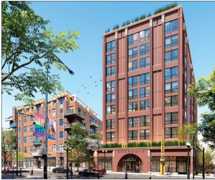
A new 10-story high tower has been proposed for Boystown for the lot adjacent to Addison and Halsted.