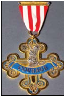
Replica of the "Courage" Medal awarded to the Cowardly Lion.