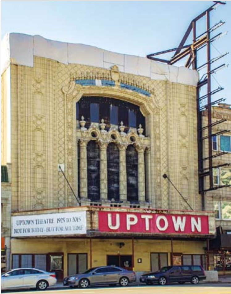
Uptown Theatre, 4816 N. Broadway, the Balaban & Katz theatre designed by Rapp and Rapp in 1925, was Landmarked in 1991.