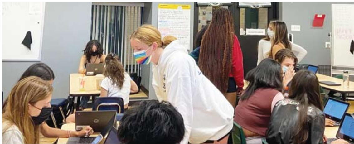
Each morning, the editors and reporters of Lane Tech's student paper come to Room 137 to learn about journalism and publishing.

Since PML's inception in 1997 as Barrel of Monkeys, its teaching artists have served more than 60 Chicago Public Schools. Over 15,000 elementary school students have participated in the PlayMakers programs, which aim to build students' writing skills, improve self-esteem, and instill confidence in their ideas and abilities.