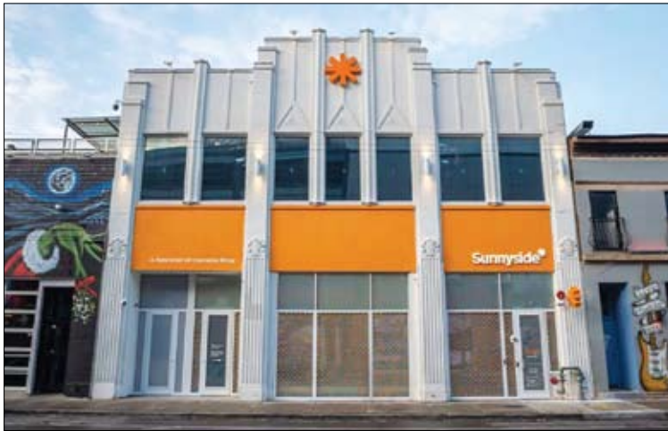
The new, 10,000-square-foot dispensary at 3524 N. Clark St. in Wrigleyville is open seven days a week.