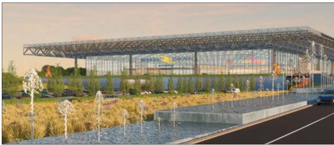
Lakeside Center [above] would be renamed Rivers Chicago at McCormick. Move in 1,000 slots and video poker machines, add 200 manned gaming tables, a sports book, toss in a few restaurants and bars and Mayor Lightfoot’s cash register could start going “ka-ching” in early 2022 with a new land-based casino.

Move in 1,000 slots and video poker machines, add 200 manned gaming tables, a sports book, toss in a few restaurants and bars and Mayor Lightfoot’s cash register could start going “ka-ching” in early 2022, since the house usually wins.