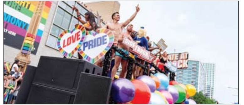
Three people were arrested after an ISIS plot to attack the 2024 Chicago Pride Parade with a backpack bomb was uncovered.