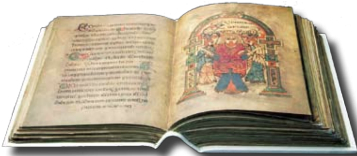
Irish is one of the oldest written and historical languages in the world.

Next time you head out to your favorite saloon or eatery feel free to use the English slang transla-