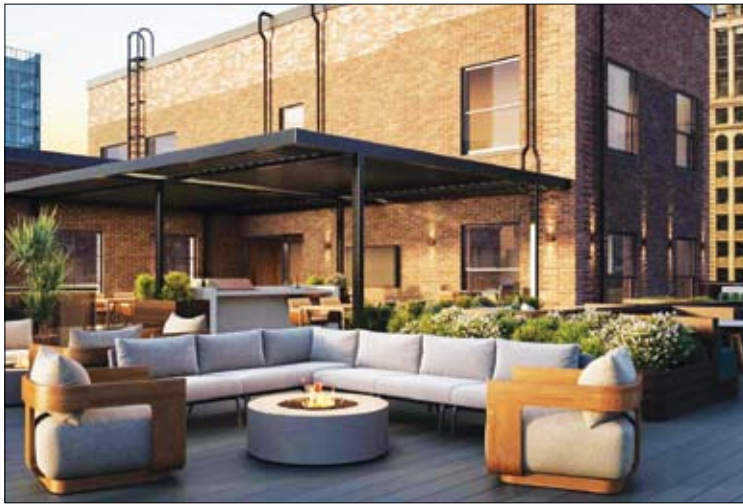
A rendering of the rooftop terrace at the future Wacker Place. The project will include 252 luxury units.