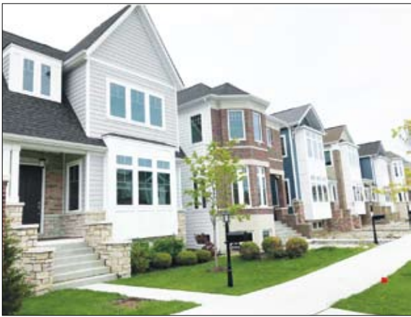
The Internet is the last place you want to go to look for a mortgage. You'll just get a lot of cold calls and SPAM emails. "If you go to Lending Tree that's where the home-loan vultures fly," said one a 25-year mortgage professional. "Lenders are paying for borrower leads. They will hound you, and hound you."

That's exactly the experience one homeowner recently had while seeking a good deal on a refinance for his North Side house after his current lender boosted his interest rate to 4.75% from 3.625% when his seven-year adjustable rate mortgage rolled over.