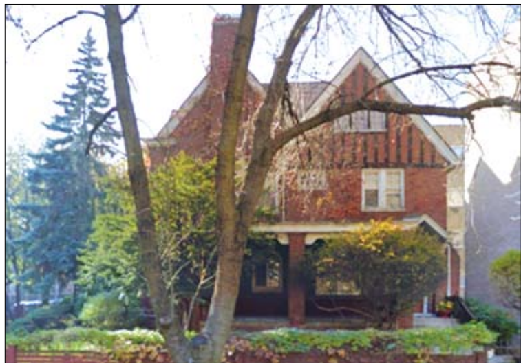
Snail Studio [above], 6106 N. Kenmore, started as a vehicle for Ken Nordine's Word Jazz and some of his other side projects.

Earlier this year the Edgewater Historical Society [EHS] sent a letter to the Chicago Commission on Landmarks requesting preliminary Landmark status for the Nordine Mansion, 6106 N. Kenmore Ave., saying that the house meets at least two of the seven criteria for designation - enough to be landmarked.