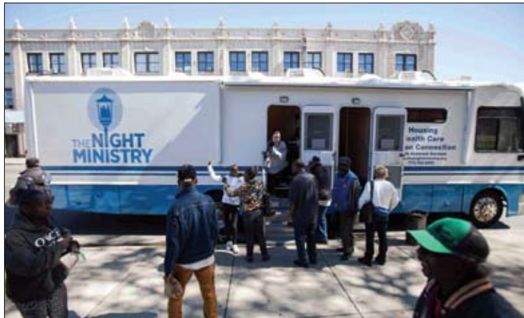
The Night Ministry's Health Outreach Bus at its stop in East Garfield Park neighborhood. The bus visits underserved communities throughout Chicago, providing free health care, meals, hygiene supplies and links to other supportive services.