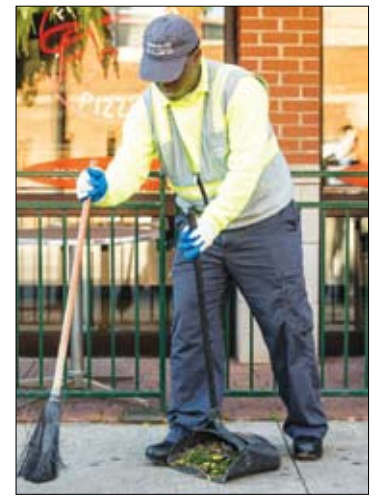
Cleanslate participants are helping to clean up the city. By working at Cleanslate interns are prepared and inspired to break the cycle of homelessness and poverty, and forge paths to real and lasting success.