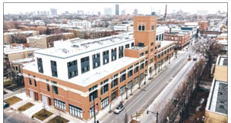
The mixed use building at 1900 W. Lawrence Ave. was built to be a Sears Department Store.