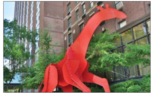
The Chicago Sculpture Exhibit, founded by former 43rd Ward Ald. Vi Daley, showcases the art of sculptors in more than 15 Chicago neighborhoods. Applications are now open for the next sculpture showcase.