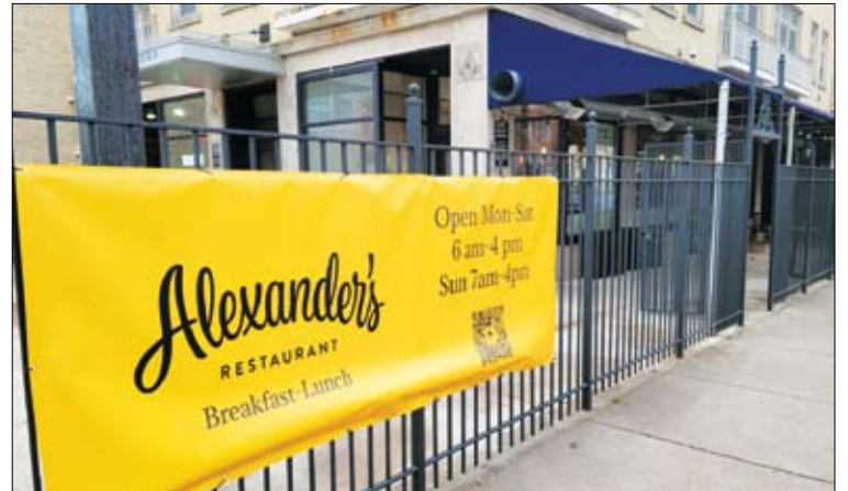
The newest Alexander's coming to Rogers Park.