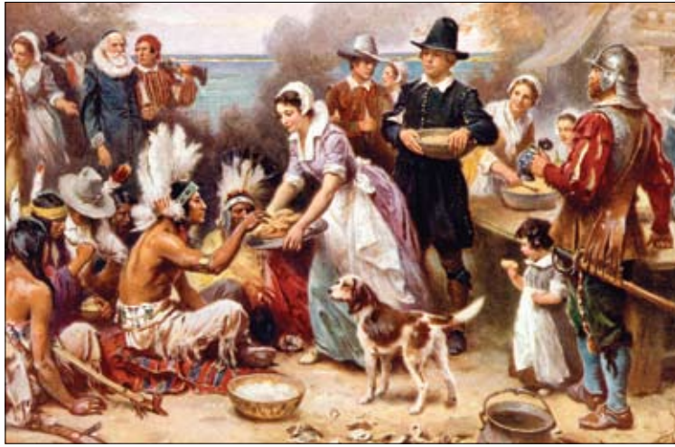
Who doesn't revel in the historical and cultural evolution of our national Thanksgiving meals of turkey and all the trimmings?

Hard to imagine the historical and political circumstances of Puritan reform that blossomed into our beloved celebration of