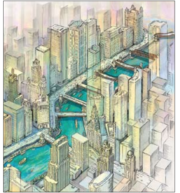
Detail from The Chicago River by Phil Thompson, Wonder City Studio.