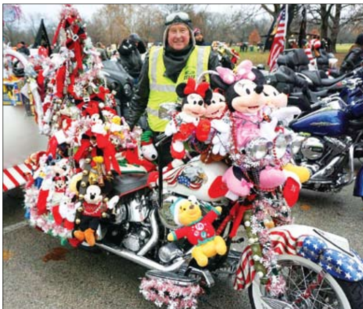
Tens of thousands of riders participate in the annual Toys for Tots Motorcycle Parade.