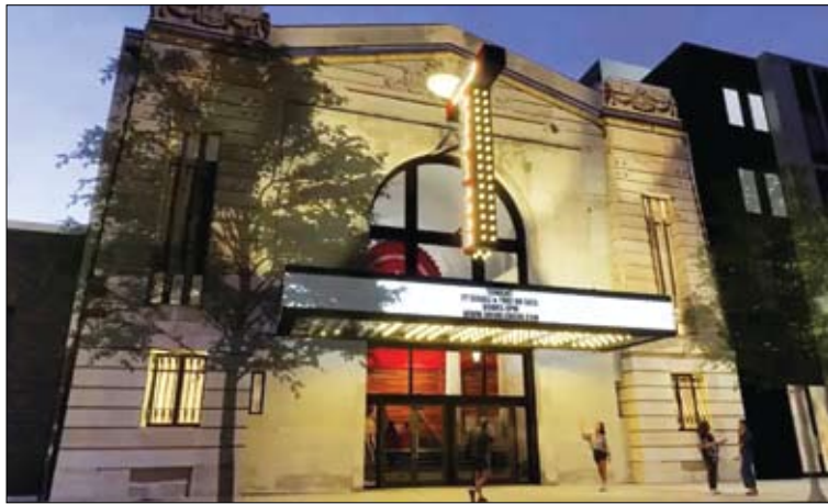
The historic Wilson Theater, 1050 W. Wilson Ave. is slated to become Double Door Bar and Nightclub next year.