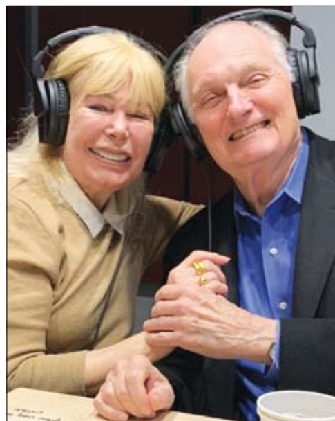
Loretta Swit and Alan Alda.