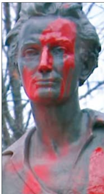
City Hall capitulation before the world's eyes in Grant Park, in removing a statue of Christopher Columbus due to radical mob violence, may be why the aggrieved today feel so safe vandalising other pieces of public art.

The Young Lincoln statue is the second one vandalized in Chicago in the past six weeks. Criminal vandals similarly spray painted a statue of Lincoln in Chicago's Lincoln Park in early October, writing the words "Dethrone the colonizers," "Land back!" and "Avenge the Dakota 38."