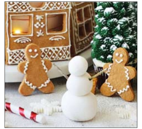
Check out the festive Gingerbread Village at the Drake Hotel.