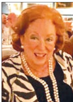
Rose Marie O'Neill