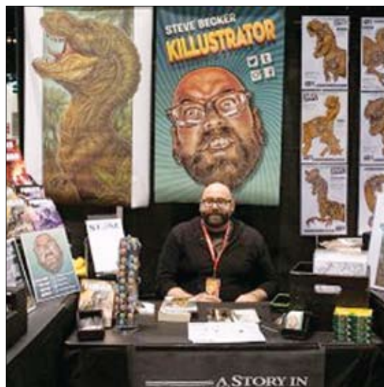
(L) Playing dress up goes to an epic level when it comes to cosplay. The largest and most prestigious cosplay competition in the world takes place at C2E2. (R) Artist Alley is a creative melting pot where you can get up close and personal with the artistic masterminds behind your favorite comic books, graphic novels, and artistic creations. Get to know local Chicago art talent, or rub elbows with the rich and famous of the comic book world.