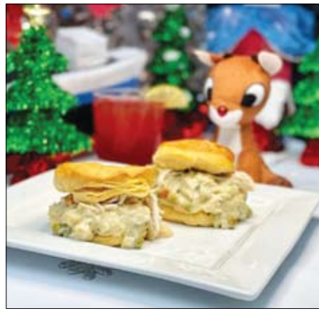
Cute holiday delights abound at Rambler Kitchen and Tap.

Earlier in the fall, the same landlord had to make $3,000 in roof, gutter, hall and