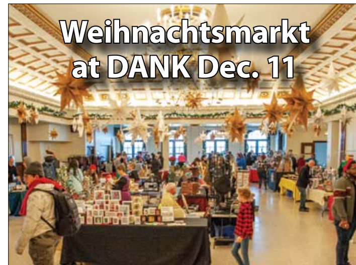
A Weihnachtsmarkt (Christmas Market) takes place 11 a.m. to 6 p.m. Saturday, Dec. 11, at DANK Haus, 4740 N. Western Ave., in the Marunde Ballroom, 5th Floor.

Short of airport-style screening stations, it's not clear how a hotel can be expected to ensure that guests don't bring a gun onto their property.