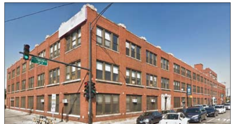
Anixter Loft at 2032 N. Clybourn Ave. may soon reach Landmark status.

Another Lincoln Park area building may be getting Landmark status as the Commission of Landmarks has approved preliminary landmark status for the Ludlow Typograph Building at 2032