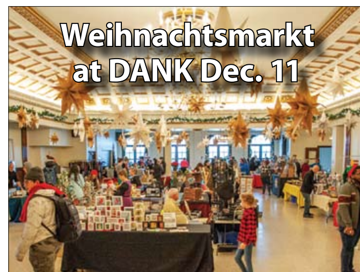
A Weihnachtsmarkt (Christmas Market) takes place 11 a.m. to 6 p.m. Saturday, Dec. 11, at DANK Haus, 4740 N. Western Ave., in the Marunde Ballroom, 5th Floor.

Short of airport-style screening stations, it's not clear how a hotel can be expected to ensure that guests don't bring a gun onto their property.