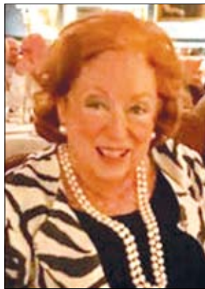
Rose Marie O'Neill