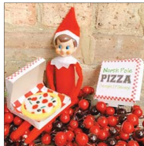
Pizza Elf kit.