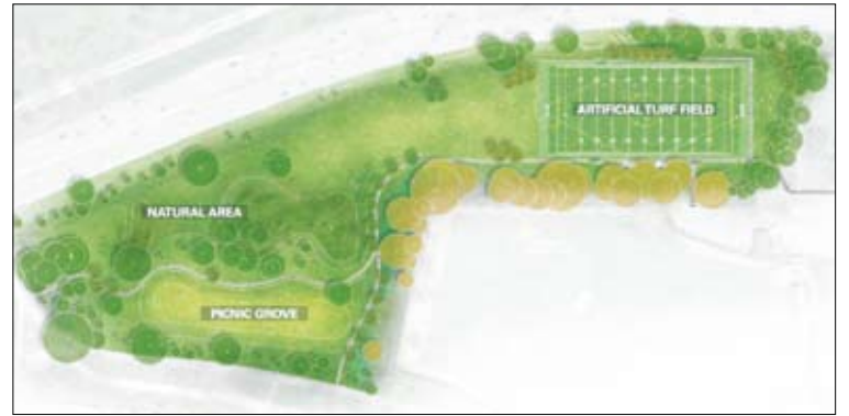
A $3 million construction project is underway at Wellington Ave. and Lake Shore Dr. for a new athletic field to be built on parkland that previously was mostly unusable due to flooding.