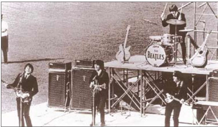
The Beatles stayed at the Edgewater Hotel during their 1965 tour stop in Chicago to perform at Comiskey Park.