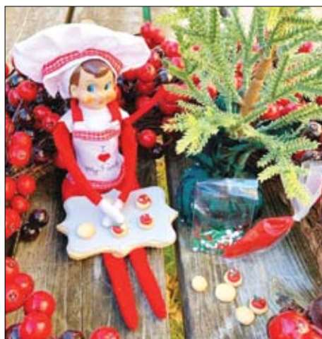
Baker Elf kit by Sweet Beets Bakery.