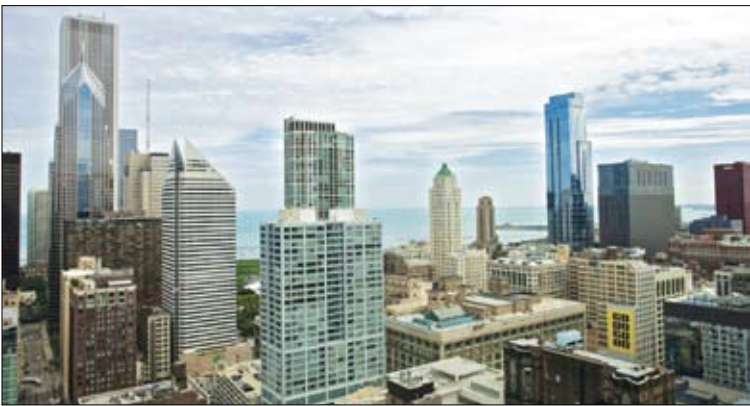
The COVID-19 assessment-value reductions average nearly 8% in the Loop, River North, Old Town, South Loop and Bronzeville.