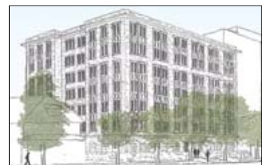
The proposed new seven-story mid-rise for 1233 W. Pratt.

The Market was sponsored by the Rogers Park Business Alliance, and intended to make sustainable, regionally produced foods available to the community.