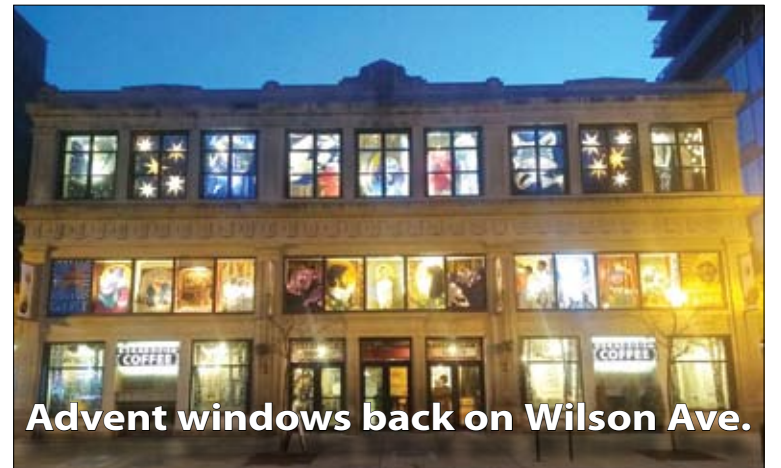
Advent windows back on Wilson Ave.

The Wilson Abbey is entering its fifth year of presenting Advent Windows during the month of December at 935 W. Wilson Ave.