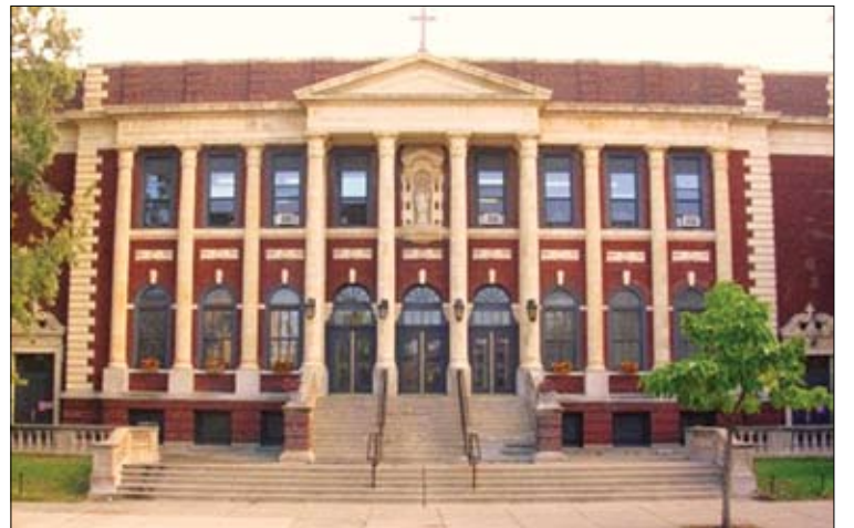
St. Ita Parish [left], 5500 N. Broadway, and St. Thomas of Canterbury Parish and School [right], 4827 N. Kenmore, will likely merge into a new consolidated parish beginning May 31, 2019.

In what may be an early sign of more moves to come, the Archdiocese of Chicago released a statement Dec. 4 regarding their plans for St. Ita Parish, 5500 N. Broadway, St. Mary of the Lake Parish and School, 4200 N. Sheridan Rd., and St. Thomas of Canterbury Parish and School, 4827 N. Kenmore.