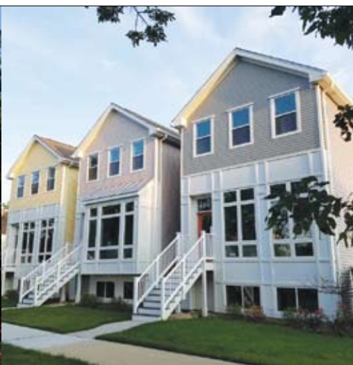
Portage Park enclave.