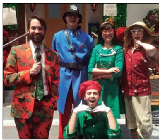
The liveliness of the Winter Wondertonians contributed to the evening's amusement.