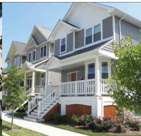
Edgebrook-Forest Glen street scene.