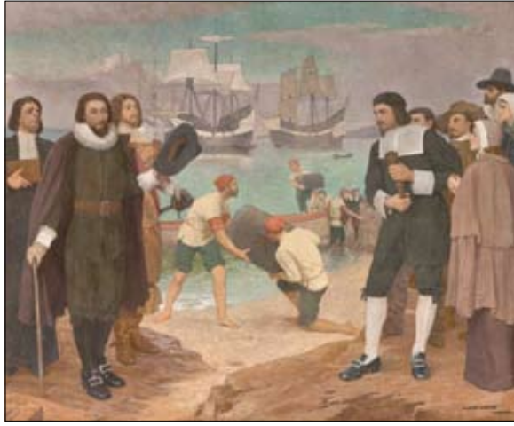
By the time the Puritans arrived they were fed up at the uncivil manner and harsh words of the elite.

In truth, these folk were just yeoman, common men. Hard-working farmers with no interest in putting on airs or lifting