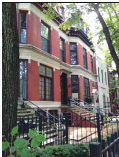
Jackson Blvd. row homes.