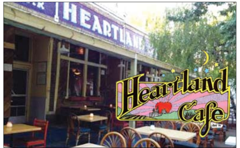
After 42 years in operation, the Heartland Cafe in Rogers Park will close down on Dec. 31.

No matter what happens next, we will need to close down for at least a few months. What we know now is that Heartland's last day of operation in our home for