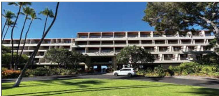
The Mauna Kea Beach Hotel hosted the festival, which was founded by James Beard Award-winning chefs Roy Yamaguchi and Alan Wong.

This year's Hawai'i Food and Wine Festival was a multi-island event held on three islands from Oct. 13-Nov 5. Co-founded by Chefs Roy Yamaguchi and Alan Wong, both James Beard Award-winners, the festival originally was begun to put a spotlight on the state of Hawai'i as a culinary destination for all travelers during a quieter time-period for travel and also to showcase the state's rich agriculture diversity by requiring all participating