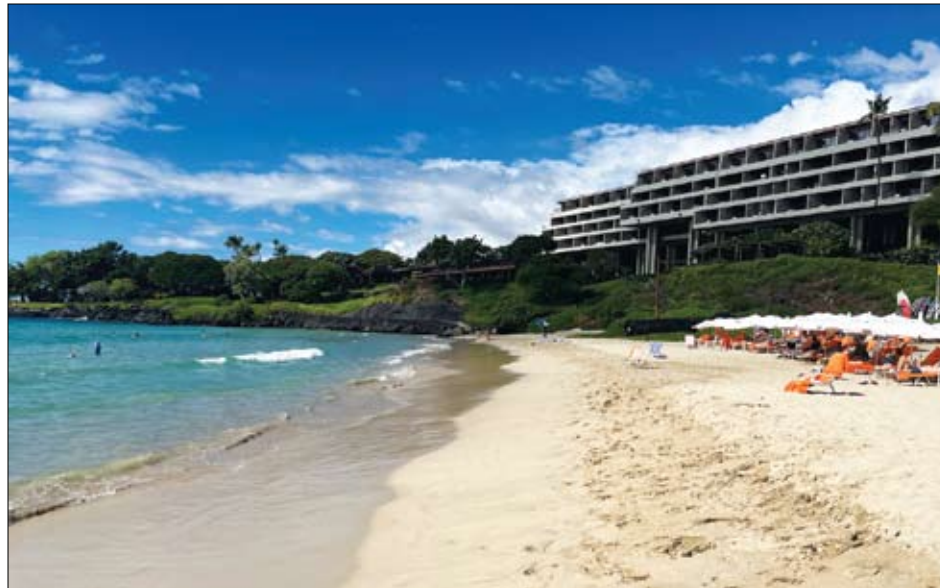
The Mauna Kea Beach Hotel in Hawai'i was the location of this year's Annual Hawai'i Food and Wine Festival.