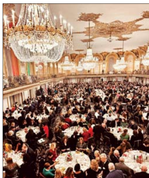
Irish Fellowship Club