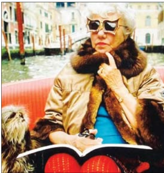
Peggy Guggenheim in Venice.

Fourteen Modernist painters journeyed to New York where they transformed the artistic sidewalks of New York. Guggenheim was relentless in her efforts to organize efforts to display the revolutionary work of these painters. The sheer scale of her efforts altered the flora