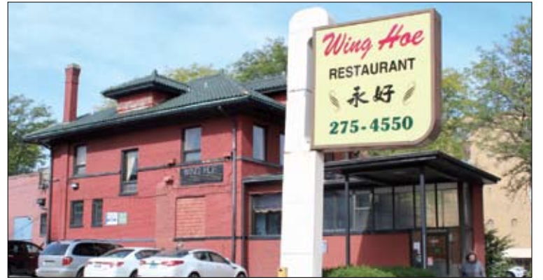
Wing Hoe Restaurant at 5356 N. Sheridan.

Last week the city also announced that sewer work on N. Bell from W. Chase to W. Touhy is now complete. This project should eliminate street cave-ins in that area due to failures in old sewers, and bring better drainage to the area to alleviate flooding that occurred during heavy rains.