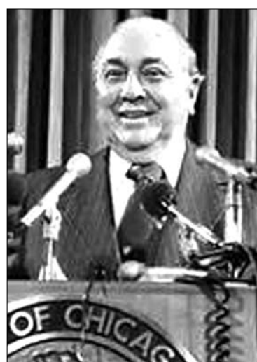
Mayor Richard J. Daley

The Chicago dynamic of the Special Olympics is dramatic and real. What a remarkable