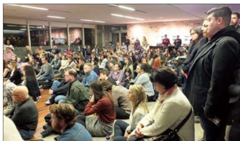
Packed overflow room as North Siders discuss civil liberties in the age of Donald J. Trump.

"Right now, we're going through what a lot of older people have seen before," said Rep. Feigenholtz, vowing never to take another election for granted ever