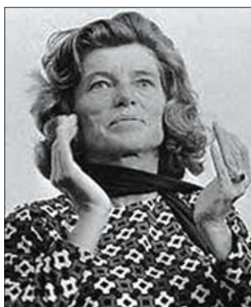
Eunice Kennedy Shriver

It was less than six weeks since the assassination of Senator Robert F. Kennedy. There were thousands of broken-hearted Kennedy volunteers who were grieving, and