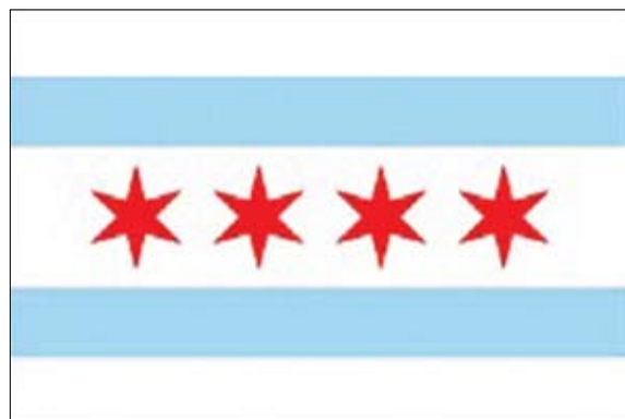
Chicago's Municipal Flag tells a story.

Pullman Park on 111th Street. It was a program for children with disabilities and she was made for the job. At the time there was not much going on anywhere for children with special needs. In fact, most children were sequestered