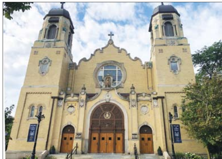
The pastor of Ravenswood's Our Lady of Lourdes Church is warning his parishioners to get ready for changes.