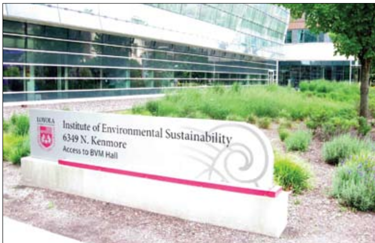
The IES has demonstrated success at the undergraduate and graduate level and has put Loyola on the map as a leader in environmental sustainability.