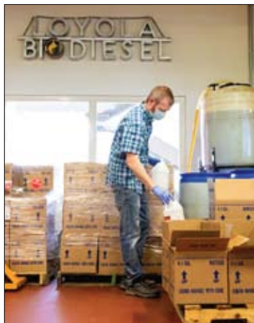
A worker prepares hand sanitizer in the Institute of Environmental Sustainability.