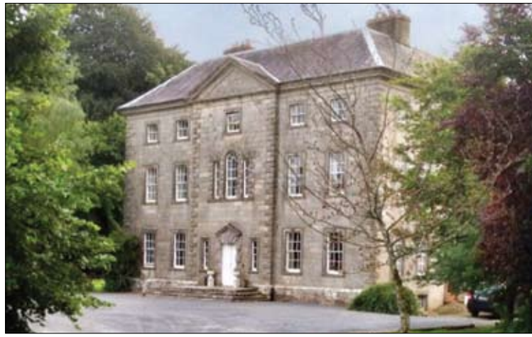
Roundwood House in County Laois, Ireland.

Buttercream cakes make up dessert before the Edith Piaf and Bach begins. I'm glad to reflect on this, to take time to measure