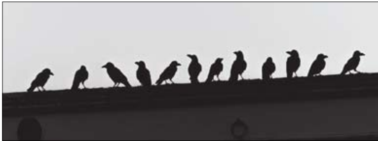
A murder of crows is a collective noun used to describe a group of crows. Typically, a murder can consist of around 15 to 1000 crows, depending on the season.

The language of Chaucer has come a long way in 600 years. It rolls off the tongue with elegance