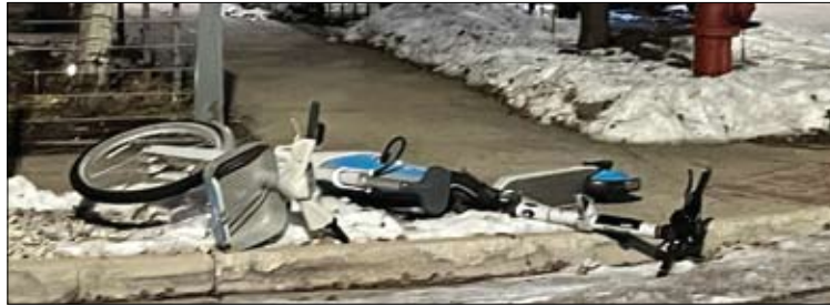
During winter, there seems to be zero incentive for the electric scooter operators to pick up their scooters when not in use.

In Oct. 2021, the Chicago City Council approved electric scooters to operate year round for a two year renewable period. Prior to the city council's approval, members of the general public and city council had raised the issue of the lack of accountability during the pilot program. In response, representatives from the electric scooter companies