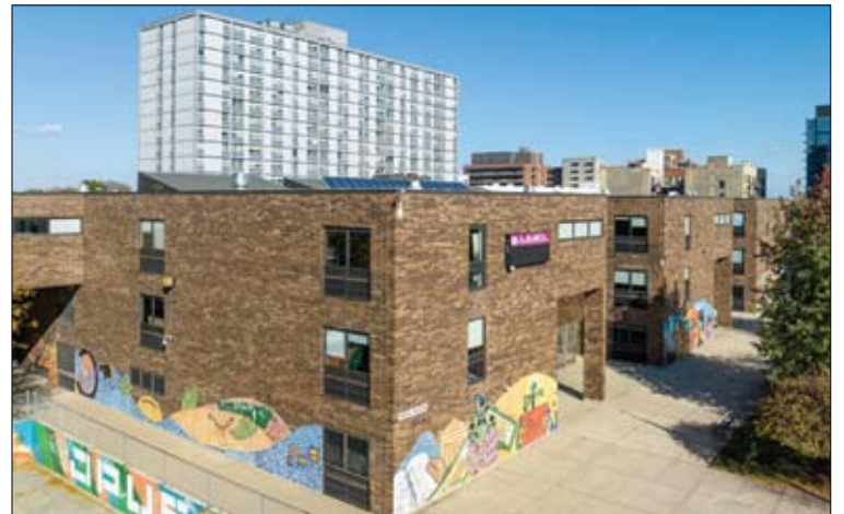
Uplift Community High School, 900 W. Wilson Ave.