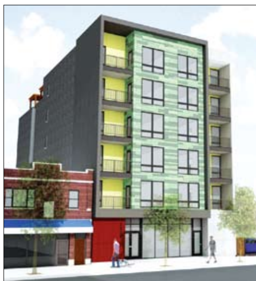
Rendering of 5830 N. Broadway. Images courtesy of Nicholas Design Collaborative