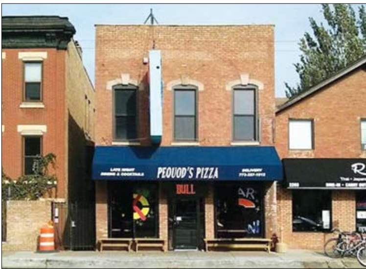
Pequod’s Pizza, 2207 N. Clybourn Ave., is ranked as the #1 pizza in the nation by Yelp. They specialize in deep-dish pizza with a caramelized crust.

Businesses in Chicago pay the second-highest state corporate in-