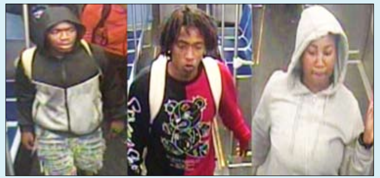
Chicago police released these surveillance images of three people suspected of participating in a robbery spree aboard the Red Line in September.

Brown is accused of stealing fragrances worth $2,606 from Ulta, 2754 N. Clybourn, on Jan. 10; stealing