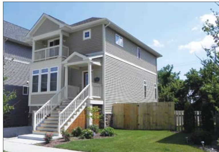
That narrow window to lock in a bargain-rate below 4% home loan this year is closing, experts say.

Mortgage rates have been in a holding pattern for most of the fourth quarter of 2017, remaining within a 10 basis-point range since