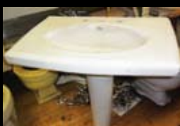
WASH YOUR FACE