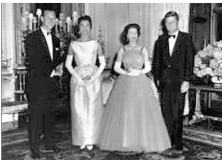
The Royals and the Kennedy's famed visit June 29-30, 1963.

The events are all common knowledge to any student of history or politics, but the series adds a layer of the personal. A layer that's rich and filled with meaning. Human emotion contributes a powerful sense of purpose and meaning to the events that unfold in season two. And a tactile sense