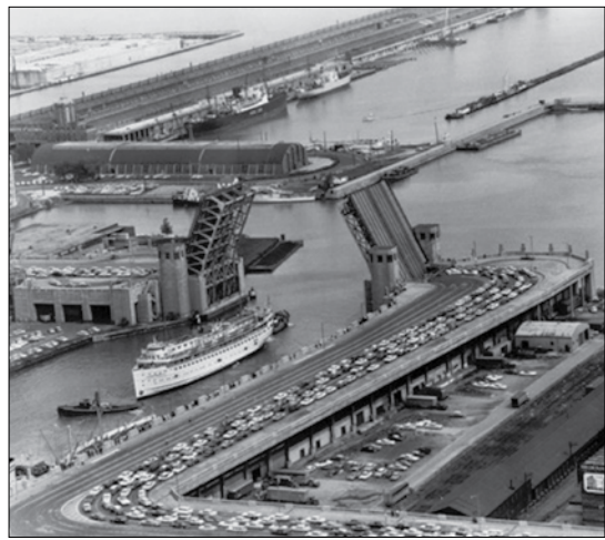
The Outer Drive Bridge and S curve of Lake Shore Dr. as seen from the Prudential Building, 1960. Navy Pier is in the left background.

These details were entered in the appropriate descriptive metadata columns in the spreadsheet. For negative enclosures with no descriptive information, we relied on the existing collection catalog record to generate a generic collection description. Addi-