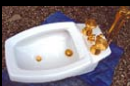
WASH YOUR BOTTOM