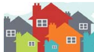
Northside Community Resources

In years past we would typically have from 40 to 100 entries from as many as a dozen or more different schools.