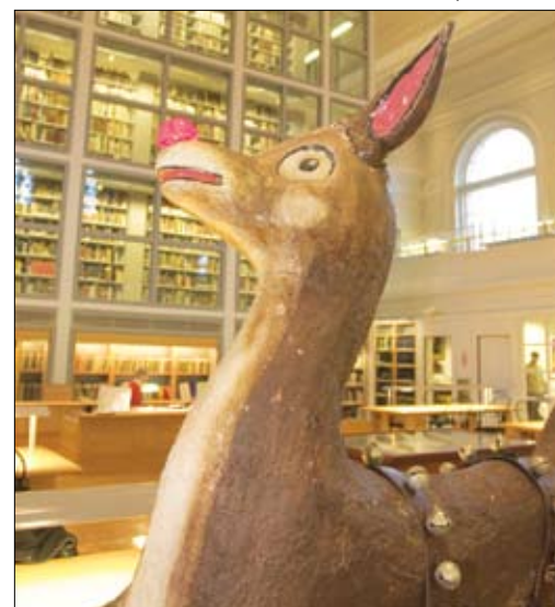
A figure of "Rudolph the Red-Nosed Reindeer" in the reading room of Rauner Special Collections Library in Webster Hall of Dartmouth College.