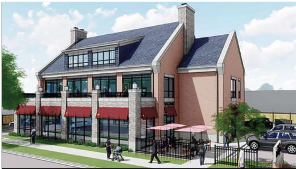
Misericordia Hearts and Flour Bakery at 6130 N. Ravenswood Ave.