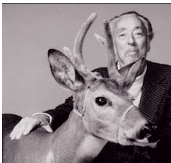
Songwriter Johnny Marks' "Rudolph the Red-Nosed Reindeer" song hit No. 1 on the U.S. charts the week of Christmas 1949.

In his Hollywood films, Fields usually portrayed a comedic character who was an alcoholic. Because Fields suffered from a skin condition that had turned his nose red, the department store executives were afraid customers would associate the young Ru-