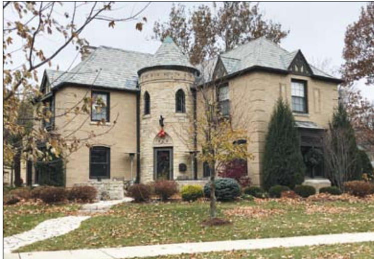
As a result of the coming rate hikes, industry experts think the interest rate on benchmark 30-year home loans may rise somewhat higher than 3.6% by the end of next year.

The Freddie Mac survey is focused on conventional, conforming, fully amortizing home-