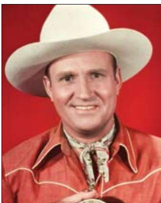
Gene Autry, former Uptown resident, recorded "Rudolph the Red-Nosed Reindeer" as a favor to his wife, who liked the Rudolph story.

a loser, just as I did. But they learn that when he gave himself to others, his handicap became the very means through which he achieved happiness. My reward is knowing that every year, when Christmas rolls around, Rudolph still brings