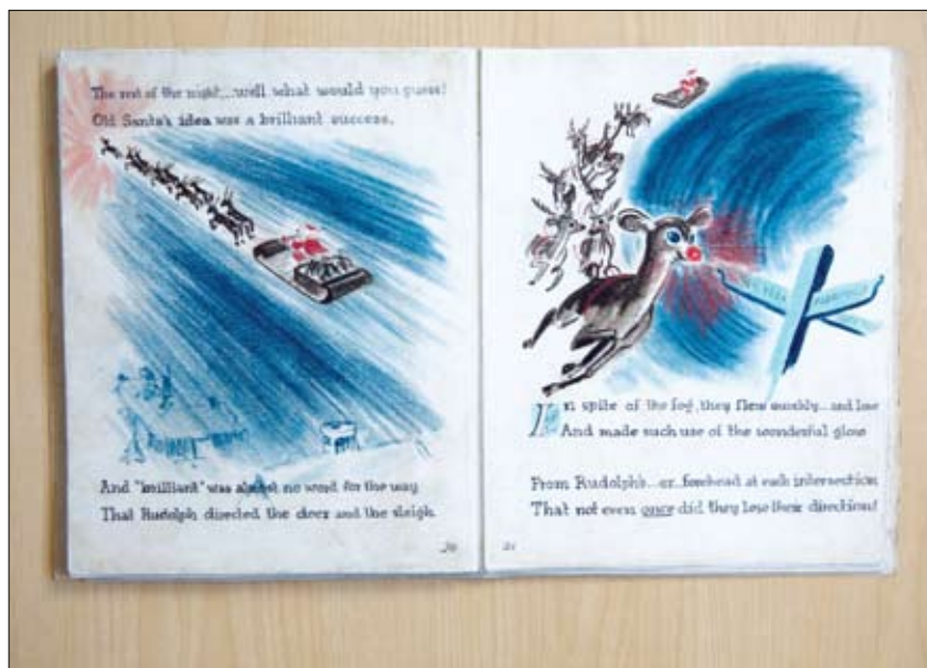
Original manuscript of "Rudolph the Red-Nosed Reindeer."