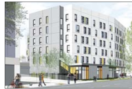
This proposed six-story senior building will be built at 835 W. Wilson Ave.

Image courtesy Landon Bone Baker Architects