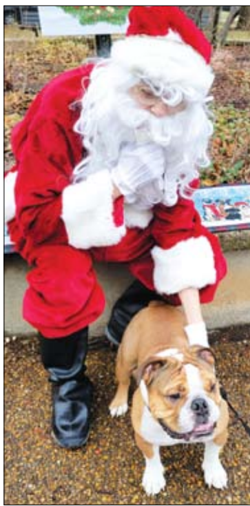
Lovable English Bulldog Mac had a visit with Santa.

For more information, go to firstnightevanston.org .