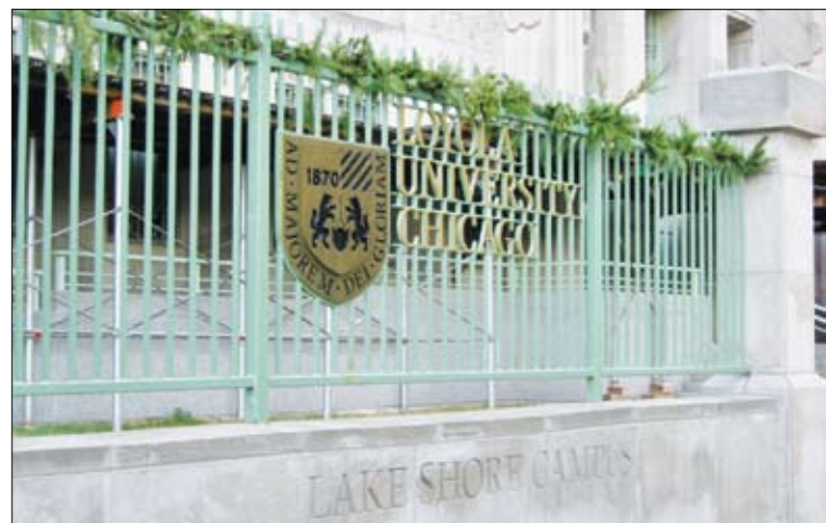
Founded in 1870, St. Ignatius was renamed Loyola University in 1909. The university began instruction at 1076 W. Roosevelt Rd. and in 1912 began a 10-year process of relocation to its Lake Shore Campus in Rogers Park.