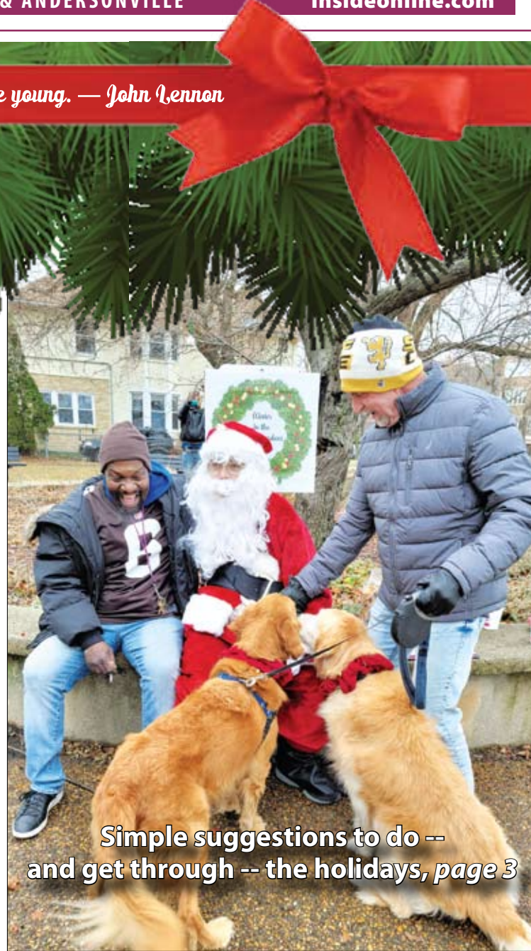
Simple suggestions to do -- and get through -- the holidays, page 3