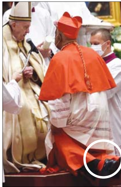
Wilton Cardinal Gregory and his red socks.

But our remembering is also the fishing nets of our goodness and our unwillingness to let anything slip away forgotten, unremembered or unloved. It's a bowl of sherry'd trifle and an empty bottle of port. Slabs of stinky Stilton. Crunchy Yorkshire puddings. Vintage champagne. Spicy mince pies. Hot tamales. Turkey drumsticks and drives to grandmother's house. It's clearing the table.