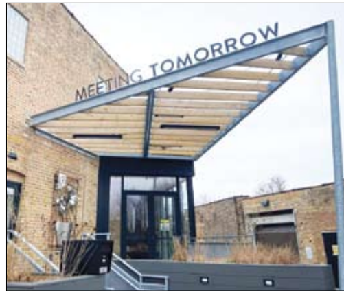
Meeting Tomorrow, 2901 W. Lawrence Ave., whose CEO contributed nearly $30,000 to Lori Lightfoot’s mayoral campaign in 2019.