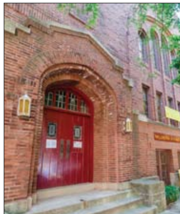
615 W. Wellington Ave.