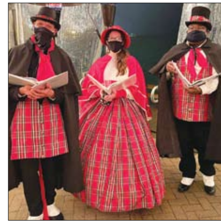
Chicago Yacht Club carolers.