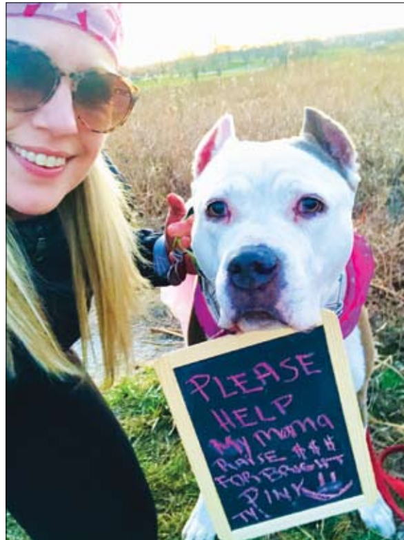
Shawna Bruchert will raise funds for the River North-based Bright Pink while running the Chicago Marathon 2021. Deadline to support her effort is Jan. 7.

6. Theaters: When you are back - and look, I know you have many, many, more things to worry about when you return. But when you can - use the Starbucks "pay it forward" type chain. Resolve to establish an "on account" ticket pool. When donors, sponsors, ticket buyers purchase a ticket, give them the opportunity to put one "on account." Use those tickets for struggling performers, se-