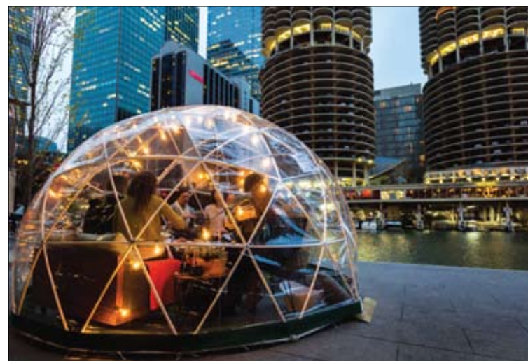
A "river dome" at City Winery on the Chicago Riverwalk. The seemingly prescient amenity was actually introduced in 2017.