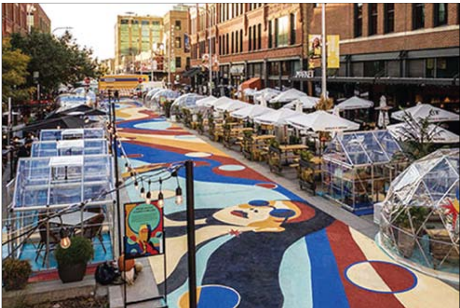
Outdoor dining in the Fulton Market community.

So far details on specifics of how and when the stricter enforcement will be enforced are scarce. Two years ago Lightfoot ran for mayor - in part - on a platform of reducing the predatory nature of City Hall when it came to camera-captured driving offenses and the severe tactics the city took to collect those debts. Lightfoot promised to end the city’s addiction to fines and fees that fall heaviest on the city’s low-income