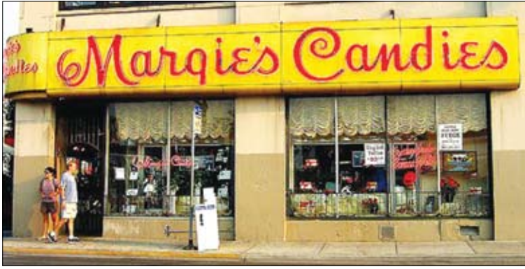
Margie's Candies, 1960 N. Western Ave.

You can be sure of this much, if you don’t actually read the books, their wisdom will never leave the page. Osmosis just won’t work to get it into your brain. If the depth of on-hand understanding and intelligence doesn’t actually