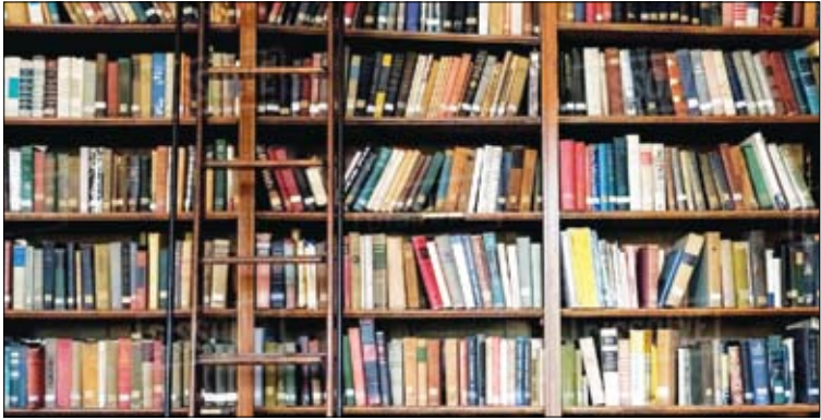
Can a person buy their reputation at a bookstore?

Our phone call brings us up close and personal with our friends, but our phone call also becomes a moment of great reveal. No longer are we simply