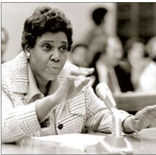
Texas U.S. Rep. Barbara Jordan

It was the voice and reason of Barbara Jordan, speaking of "a