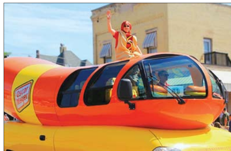
Oscar Mayer Wienermobile is in town now looking for hot dogs to drive their big four-wheeled weiner. Applications close Jan. 31 and will not reopen until next year.

Now I don't know about the Metropolitan YMCA of Greater Chicago finances, but I do know that when the New City development replaced the New City YMCA at 1515 N. Halsted St., the property sold for like $54 million. That Y, disposed of in 2007, was like a tale of two cities -- it not only catered to wealthy Lincoln Parkers but also to the struggling residents of Cabrini Green. Yet when Cabrini-Green toppled so did New City Y membership and Y officials took advantage of the area's red hot prices and sold the