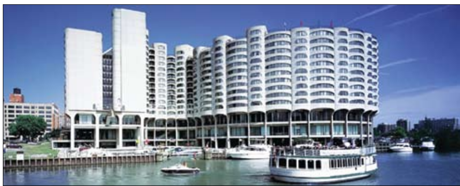
One of Nicholas Gouletas' projects was a conversion to the serpentine River City Condos overlooking the Chicago River in the South Loop. It is one of the few housing projects offering privately owned boat dockage near downtown.