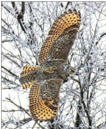
Near North Sider Jerry Wunder's Great Horned Owl in flight photo.