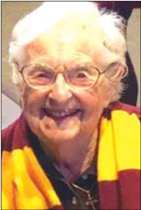
Sister Jean Schmidt, BVM