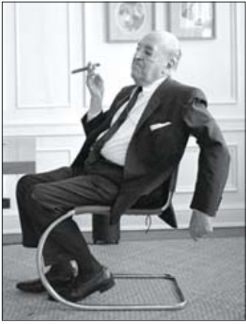
Ludwig Mies van der Rohe