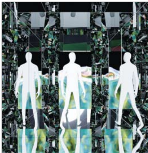
Catch the Quantum Mirror exhibit at the Mag Mile gallery ArtSpace8.