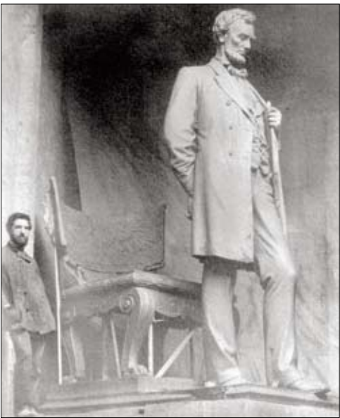
Sculptor Augustus Saint-Gaudens and the Standing Lincoln.

Maybe someone has reached out to us for assistance and we have become a part of their struggle for survival. Helping keep