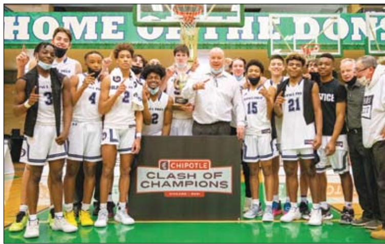
DePaul Prep Rams are winners of the Chipotle Clash of Champions.