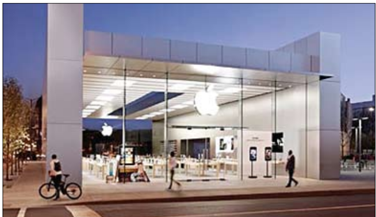
The Apple Store for sale is at 801 W. North Ave.