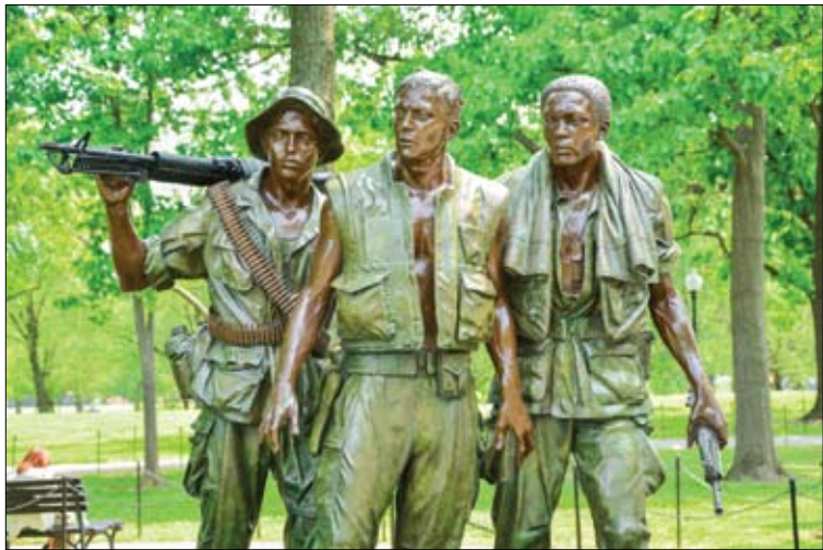
Three Servicemen is a bronze statue by Frederick Hart. Unveiled on Veterans Day, November 11, 1984, on the National Mall in Washington, D.C., it was the first representation of an African American on the National Mall.