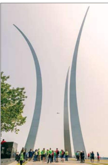
The Air Force Memorial is located in Arlington County, VA, on the former grounds of the Navy Annex near The Pentagon and Arlington National Cemetery.

After the World War II Memorial, we boarded the buses and