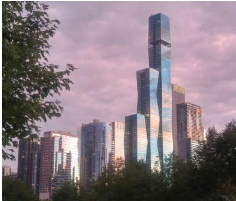
The St. Regis building itself began its life as the Wanda Vista Tower.