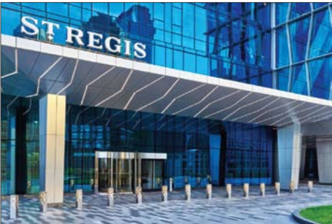
The riverfront St. Regis Chicago Hotel at 401 E. Wacker Dr.

Initially The Alinea Group was supposed to be in charge of food and beverage in the building. Alinea Restaurant, a three Michelin star restaurant, decided in late