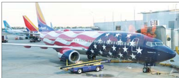
A Welcome Home banner (top) greeted vets returning from Washington, D.C. (Bottom) Southwest Airlines special red, white and blue airplanes, used only used for Honor Flights throughout the country, are provided by Southwest at a special cost.

800, Southwest Airlines painted in a special red, white and blue motif with stars and red stripes. Used only for Honor Flights throughout the country, these airplanes are provided by Southwest at very special cost factors.